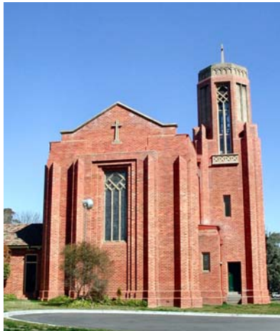
St Paul's Church building