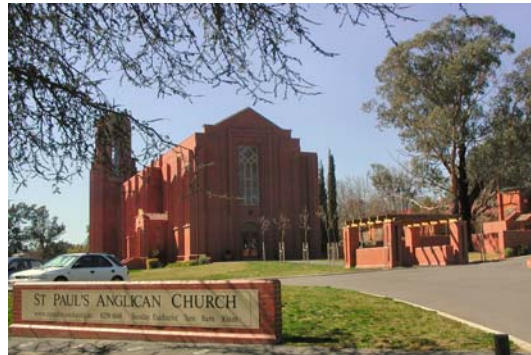
St Paul's Church building