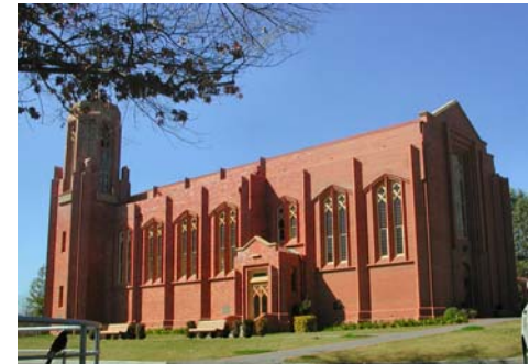
St Paul's Church building