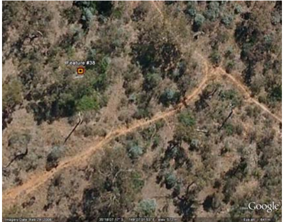
(feature # 38) GDA 94 E692473 N6091422 A 1 metre boundary surrounds this GDA reference.