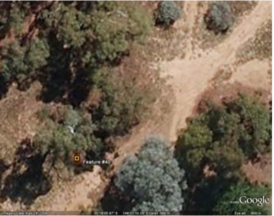
(feature # 40) GDA 94 E692702 N6091438 A 1 metre boundary surrounds this GDA ref.