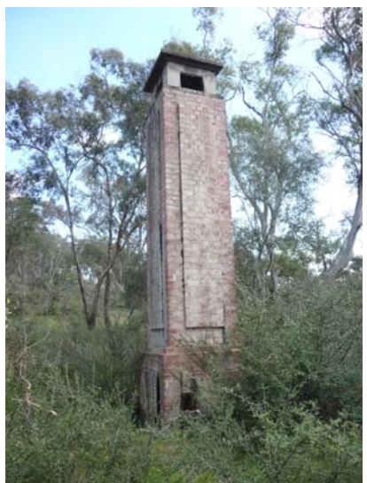
Ventilation shaft (feature # 36)