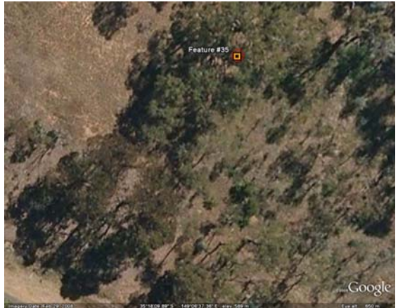
(feature # 35) GDA 94 E691885 N6091357 A 1 metre boundary surrounds this GDA reference.