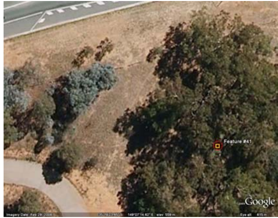
(feature # 41) GDA 94 E692841 N6091503 A 1 metre boundary surrounds this GDA reference.