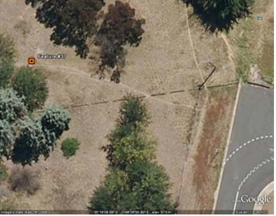
(feature # 37) GDA 94 E692192 N6091385 A 1 metre boundary surrounds this GDA ref.