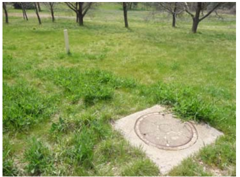
Access Chamber (feature # 37) in Stirling Park.