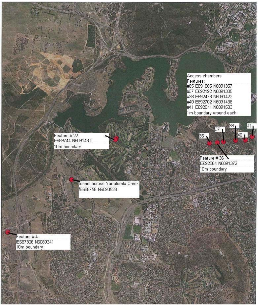
SITE PLAN Canberra's Main Outfall Sewer - location of features