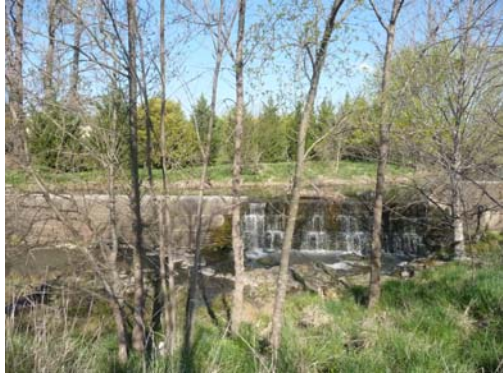
tunnel at Yarralumla Creek (sewerage tunnel forms part of the weir)