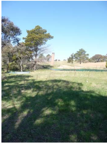
Ventilation Shaft (feature # 4)