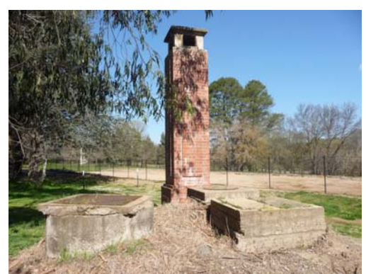
Ventilation shaft (feature # 22)