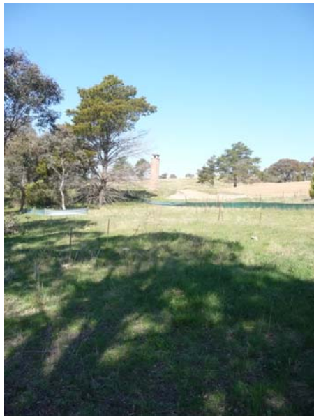
Ventilation Shaft (feature # 4)