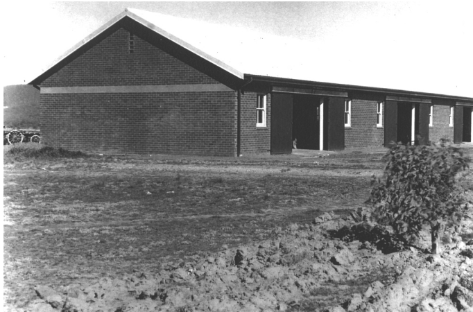
The completed Workshop in 1940.