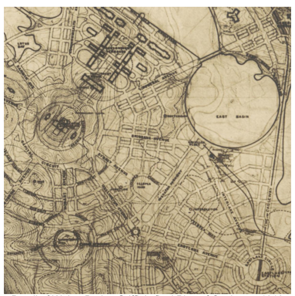
Detail of Walter Burley Griffin's final Plan of Canberra, 1918 'Canberra plan of city and environs. Walter Burley Griffin, Federal Capital Director of Design and Construction'

The Manuka and Telopea areas are named after features identified on Walter Burley Griffin's original plan for Canberra—Manuka Circle and Telopea Park (now the site of the Telopea Park School).