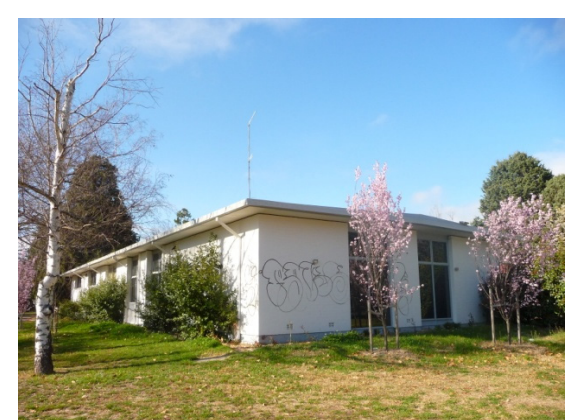
Studio two 1968