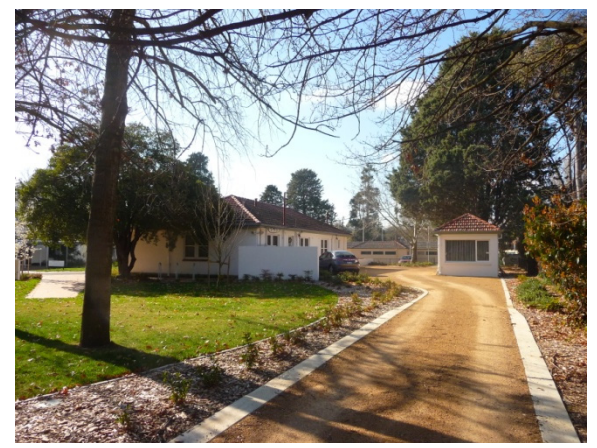
Former Griffith Child Welfare Centre building This small garage became a teaching studio c.1966