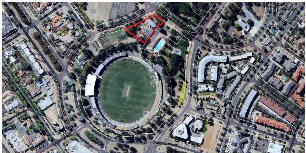
Place boundary indicated by solid red line