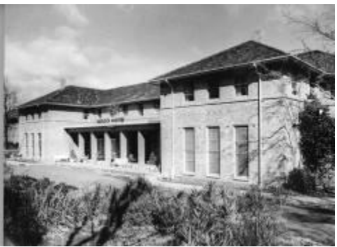
Image 5 Havelock House main entrance, 10 September 1971