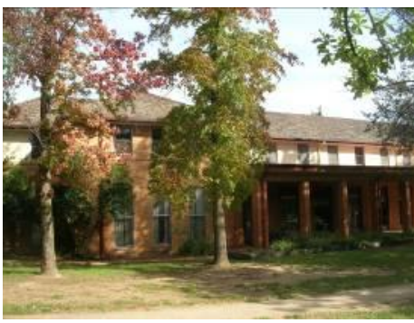
Image 9 View from northwest showing the verandah off the original dining room. 22 April 2014