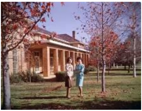
Image 4 Havelock House 1963