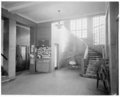
Image 3 Foyer of Havelock House, 1959 showing the curved stair and timber veneer panelling.