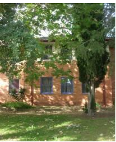
Image 13 Detail of west elevation – south end 22 April 2014