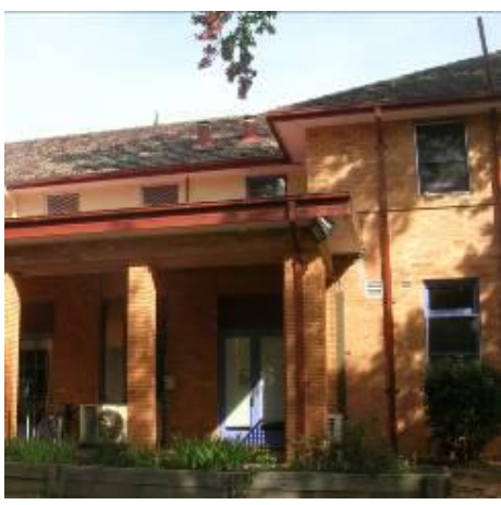
Image 10 Detail of brickwork to north verandah 22 April 2014