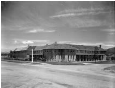
Image 2 Havelock House, December 1952