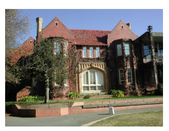
Figure 3: East Wing (1929)