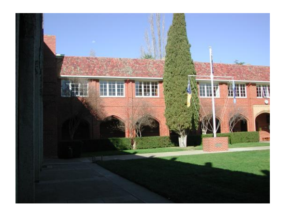
Figure 4: East Wing Cloisters (1929)