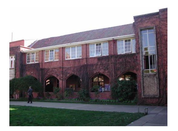
Figure 7: Garran House (1939)