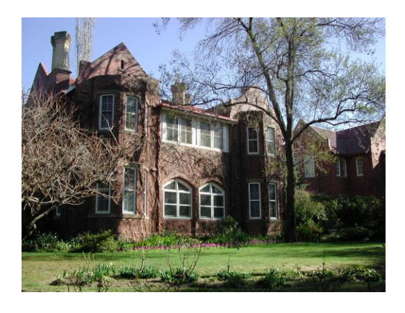
Figure 5: Headmaster's Residence (1934)