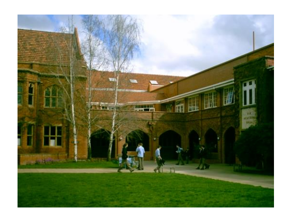
Figure 8: Gymnasium (1958)