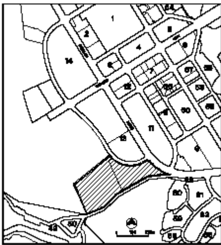
Figure 3 Greenway