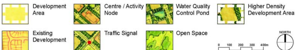
Map 1 – Coombs Concept Plan