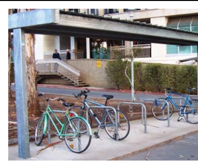
Figure 2 – Examples of Acceptable Bicycle Rail Parking Facilities

The Bicycle Rail is one of the most versatile methods of bicycle parking because it: