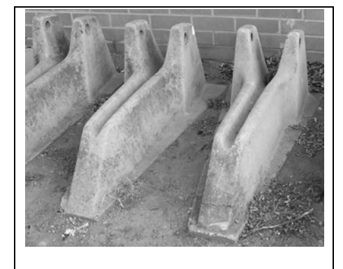
Figure 3 – An Example of Unacceptable Parking Installations

For Bicycle Parking <u>Facilities</u> based on Bicycle Rails to be acceptable as Class 3 Bicycle Parking Facilities, they must: