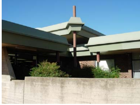
Figure 6. Dickson Library, SW corner (Truscott 10/4/08)