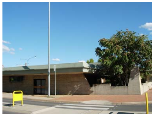
Figure 2. Dickson Library, N façade (Truscott 10/4/08)