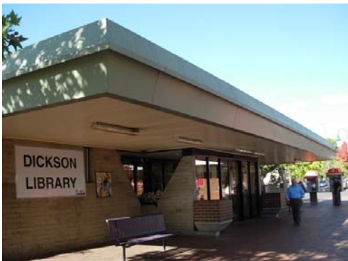
Figure 9. Dickson Library, S side - entrance (Truscott 10/4/08)