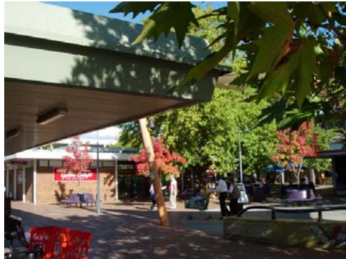
Figure 8. Dickson Library, S 'court' (Truscott 10/4/08)