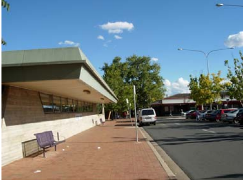
Figure 5. Dickson Library, W façade (Truscott 10/4/08)