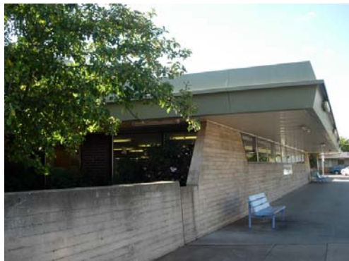
Figure 10. Dickson Library, E façade (Truscott 10/4/08)