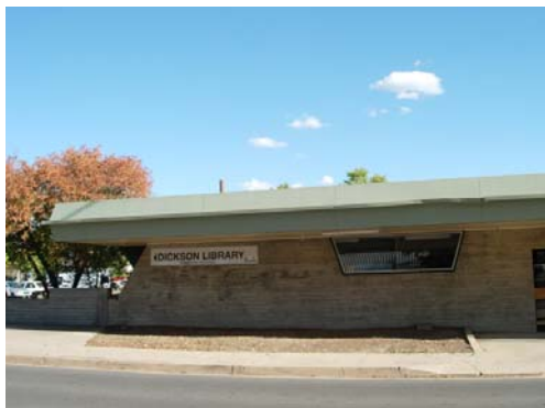
Figure 1. Dickson Library, N façade (Truscott 10/4/08)