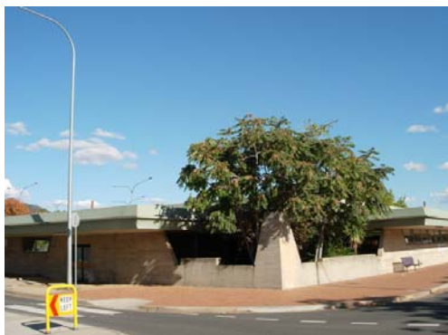
Figure 3. Dickson Library, NW corner (Truscott 10/4/08)