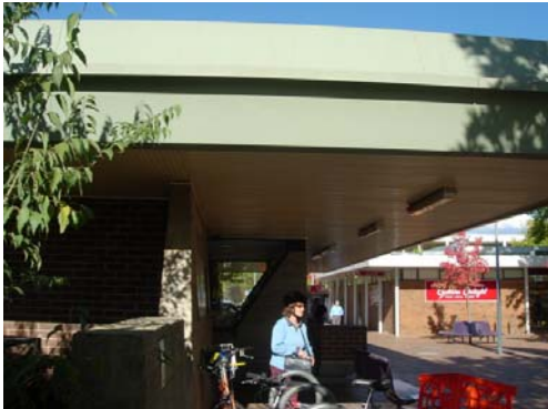
Figure 7. Dickson Library, SW corner (Truscott 10/4/08)