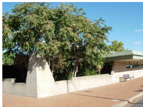
Figure 4. Dickson Library, NW corner (Truscott 10/4/08)