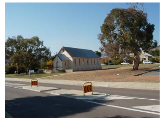
Figure 3. Sacred Heart Church, from NW (Truscott 11/4/08)