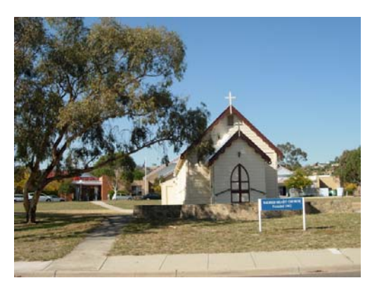
Figure 6. Sacred Heart Church and St Francis of Assisi Parish Centre (Truscott 11/4/08)