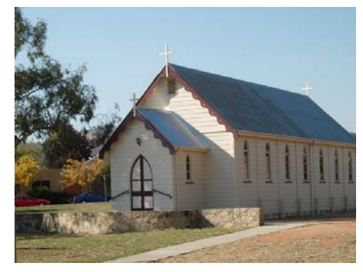
Figure 4. Sacred Heart Church from NW (Truscott 11/4/08)