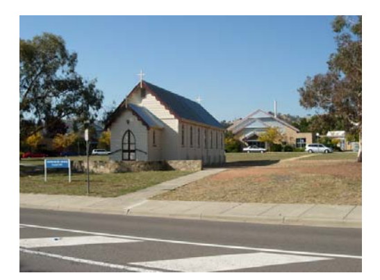
Figure 5. Sacred Heart Church and St Francis of Assisi Parish Centre (Truscott 11/4/08)