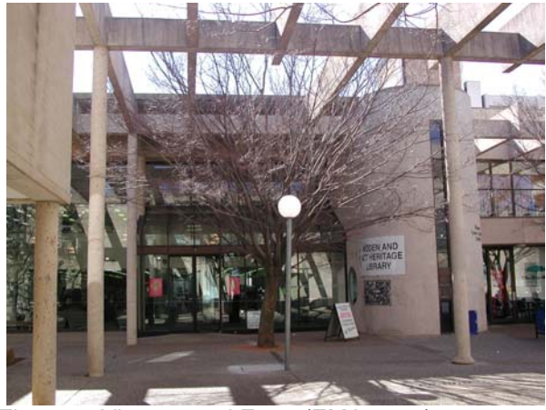
Figure 4. View toward Entry (EMA 2004)