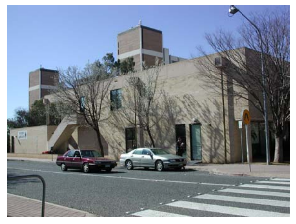
Figure 3. View from SW along Corinna Street (EMA 2004)