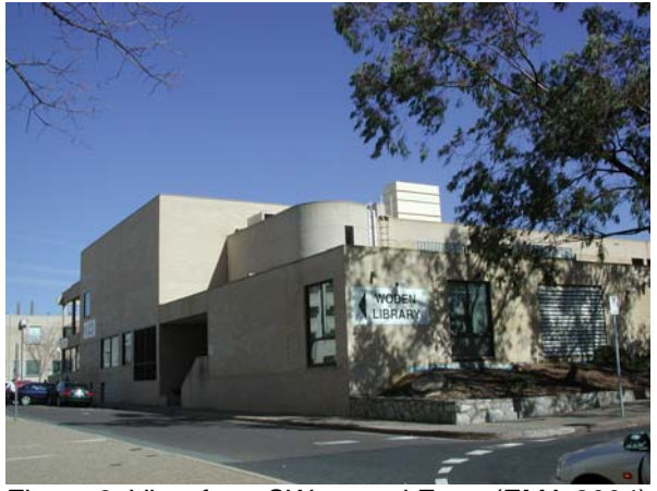
Figure 6. View from SW toward Entry (EMA 2004)