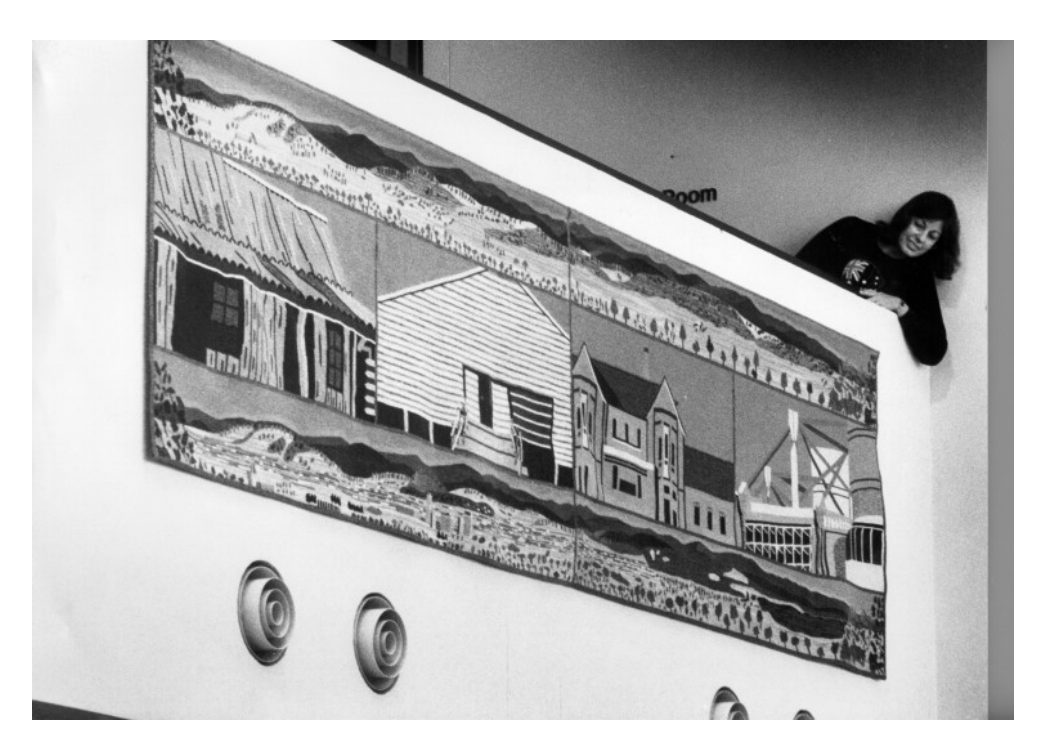
Figure 9. Woden Valley Tapestry by weaver Belinda Ransom