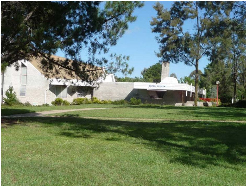
Giralang Primary School, Giralang