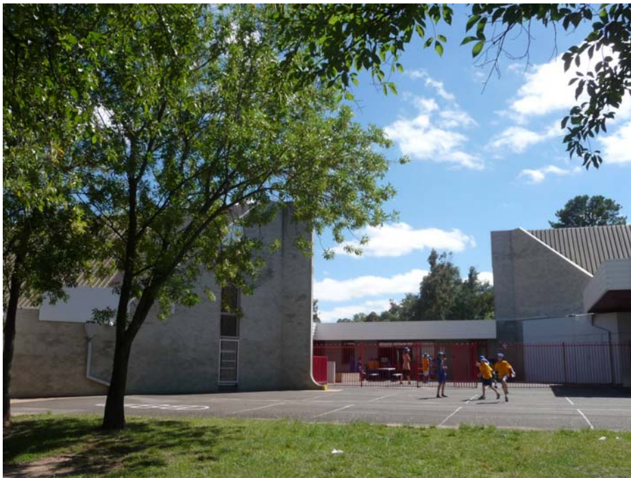
Giralang Primary School ,Giralang