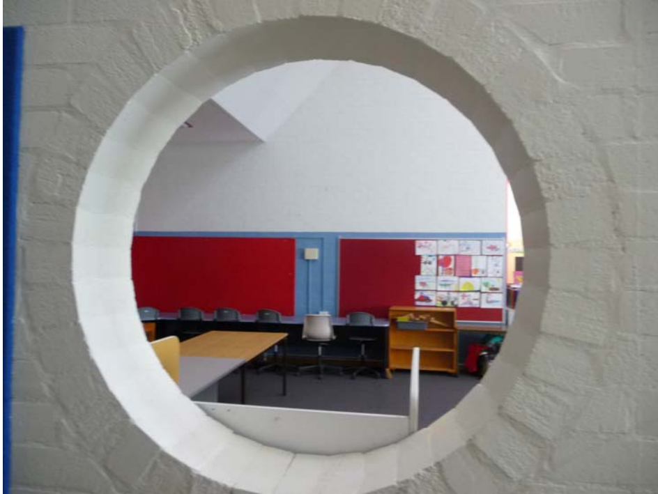
Giralang Primary School, interior of classroom