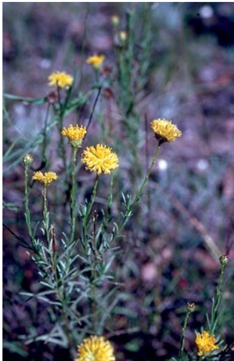
Figure 2. Button Wrinklewort