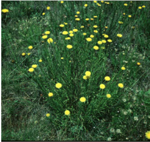
Figure 1. Button Wrinklewort in flower