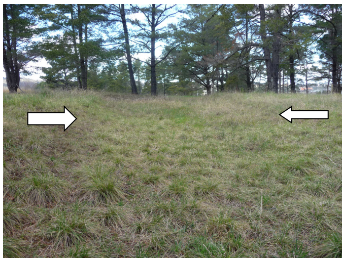
The embankment (marked by arrows) looking southeast towards Dudley Street