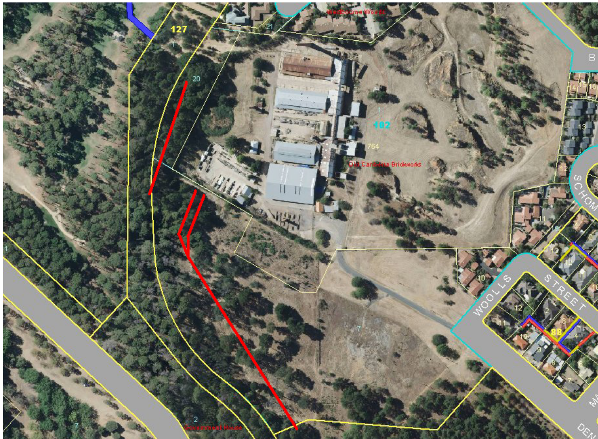
Figure 1. Location of Yarralumla Brickworks Railway Remnants. Red line denotes approximate location of the remnants of the former railway