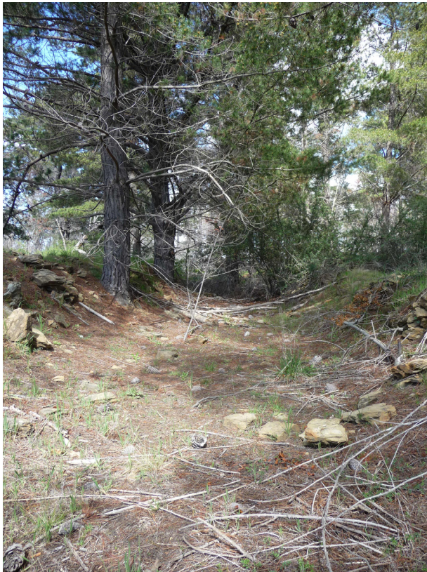
One of the three former lines where it goes through a short cutting