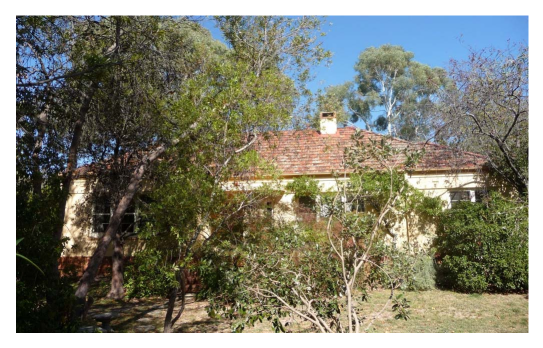
Figure 2. View of 70 Dominion Circuit, Deakin from property boundary