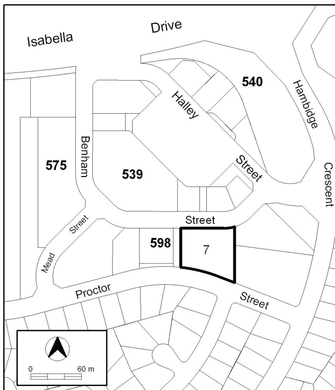
Figure 1 Chisholm