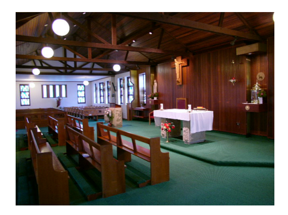
Interior St Patrick's Church Braddon