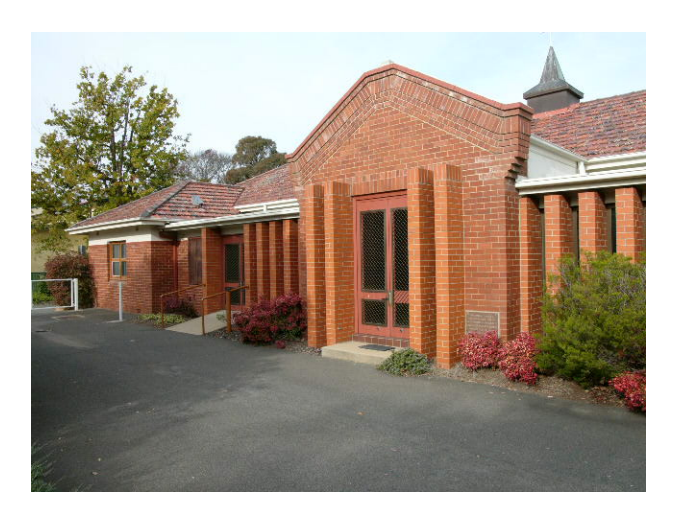
St Patrick's Church Braddon 2010