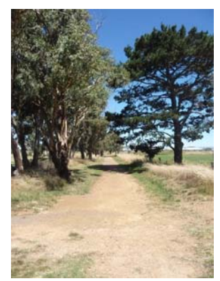
Well Station Road