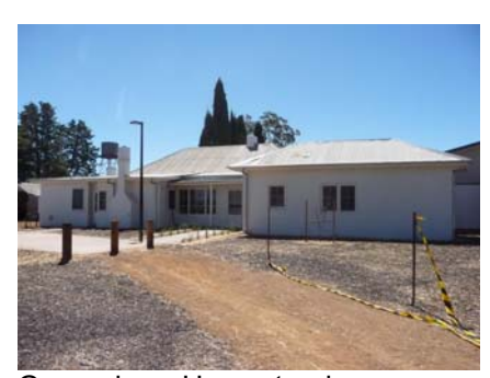
Gungaderra Homestead - rear