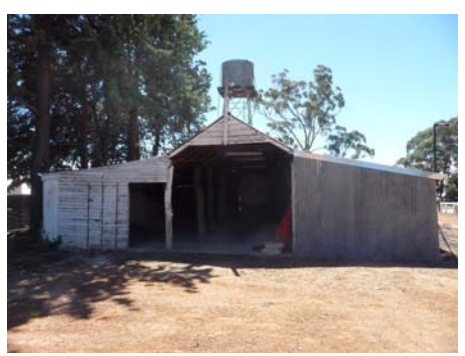
Machinery shed and water tank