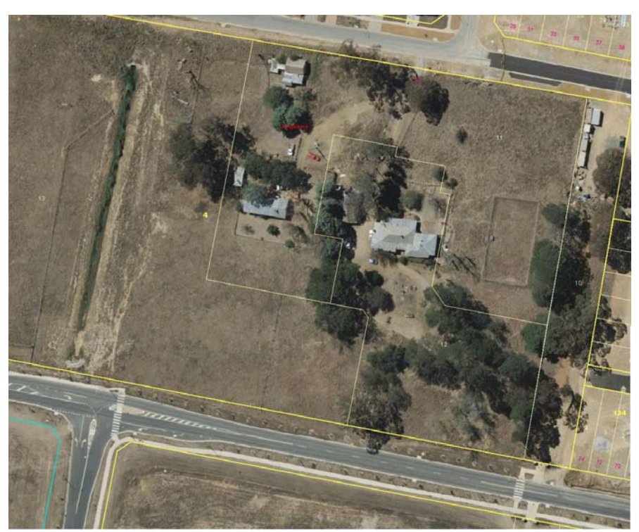
2009 aerial imagery of the Gungaderra homestead, showing individual features n.b – the buildings to the west of Block 12 have been demolished to make way for new housing development.

The area immediately surrounding Gungaderra Homestead has been developed as townhouses and is no longer the pastoral landscape of this aerial image.