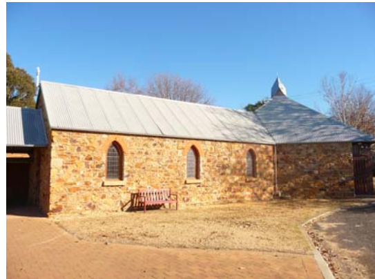
Original church building and 1978-79 extension