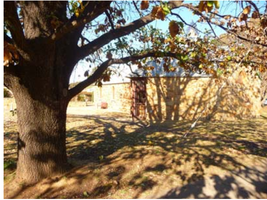
Elm tree and church