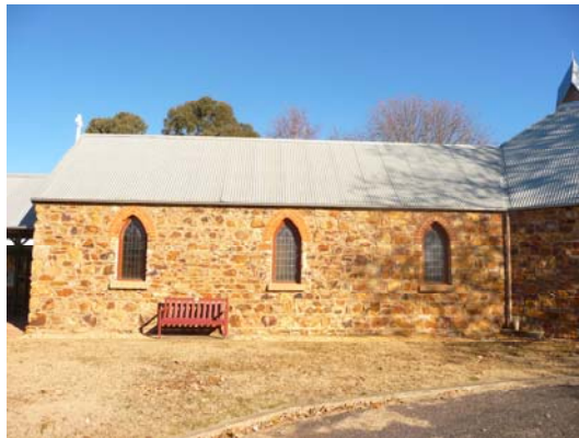
Original church building

The following images were taken on 24 June 2011