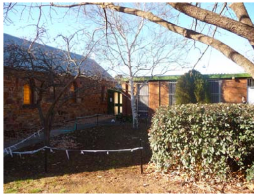
Original church and 1961 office