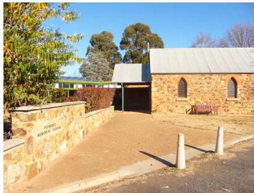
1942 Pioneer Memorial Garden