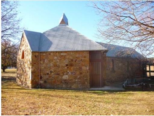
1978-79 extension with original church

Original church with 1978-79 extension to rear, and 1961 office and hall to the left of image