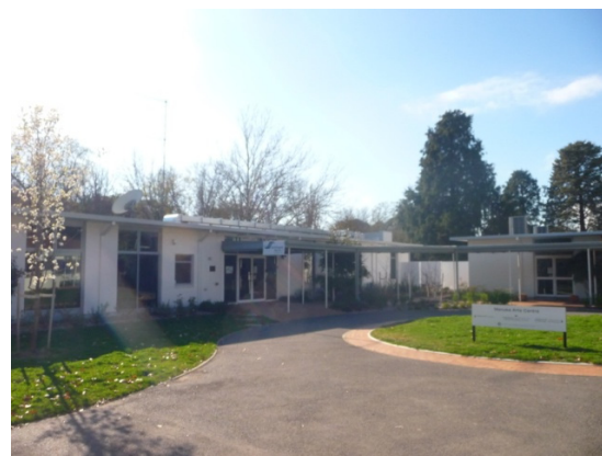
Studio two 1968