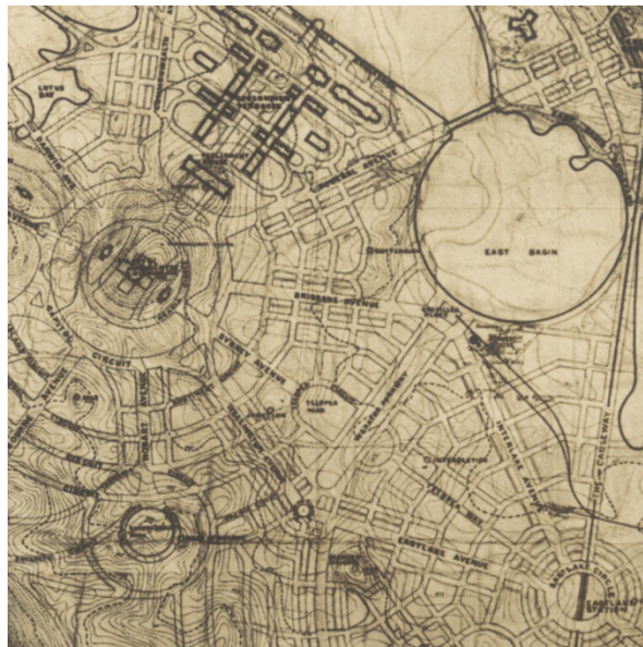
Detail of Walter Burley Griffin's final Plan of Canberra, 1918 'Canberra plan of city and environs. Walter Burley Griffin, Federal Capital Director of Design and Construction' National Archives of Australia, A13312-8

The Manuka and Telopea areas are named after features identified on Walter Burley Griffin's original plan for Canberra—Manuka Circle and Telopea Park (now the site of the Telopea Park School).