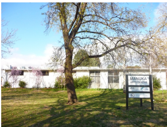
Studio two 1968