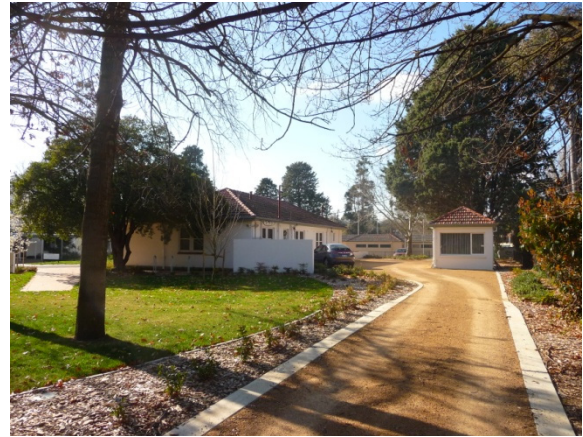
Former Griffith Child Welfare Centre building This small garage became a teaching studio c.1966