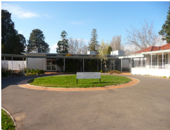
Circular driveway and Studio one 1967