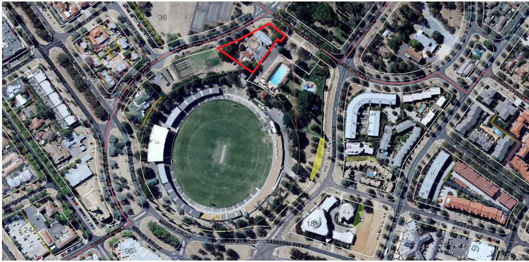
Place boundary indicated by solid red line