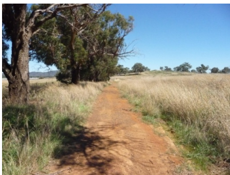
Well Station Road