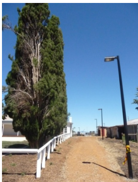
Roman cypresses lining entrance to homestead Showing relationship of homestead and machinery shed