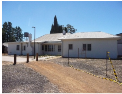
Gungaderra Homestead - rear