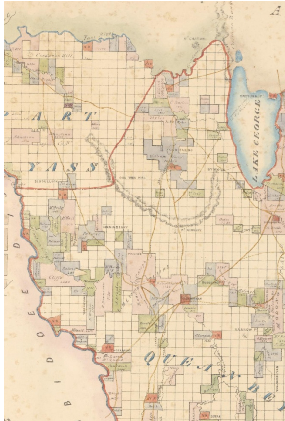
Map of the County of Murray cartographic material Eastern Division N.S.W. compiled, awn and printed at the Department of Lands Sydney N.S.W , n.d. NLA 5019246

Well Station Road was established as a track linking the Gungaderra and nearby Wells Station properties with other places and properties in the area, including Campbell's Duntroon estate which was one of the major properties in the district at the time.