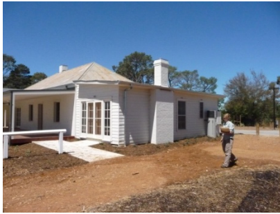
Gungaderra Homestead – front