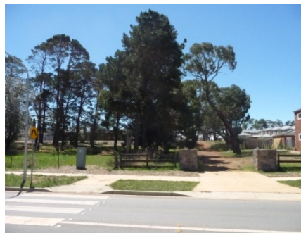
Mature plantings to the rear of Gungaderra Homestead Located on Block 12 Section 4 Harrison