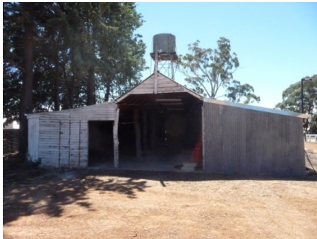
Machinery shed and water tank