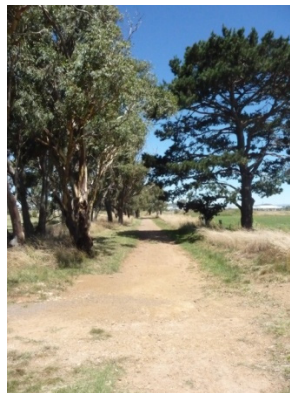
Well Station Road