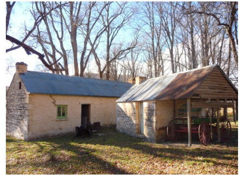
Blythburn cottage and kitchen at rear