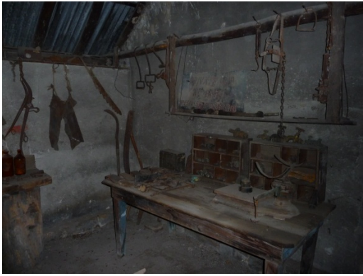
Blacksmith's - interior