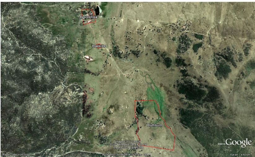
Site Plan Overview