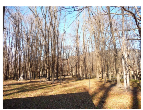
Blythburn water tank