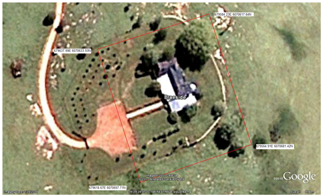
Boundary surrounding Braeside homestead indicated by solid red line