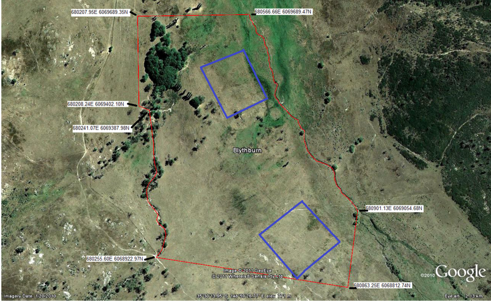
Boundary surrounding Blythburn homestead, mature trees and ploughlands indicated by solid red line Approximate location of Blythburn ploughlands are indicated by areas identified by solid blue lines