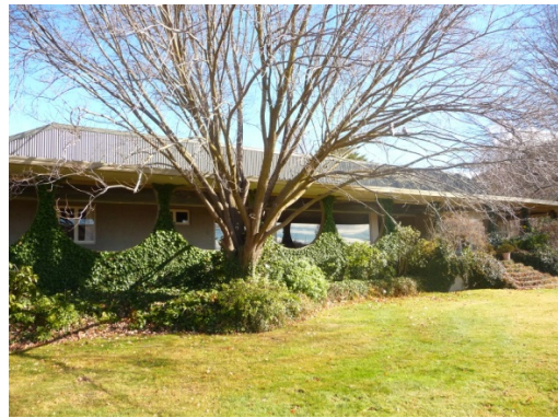
Booroomba Homestead - 17 June 2011