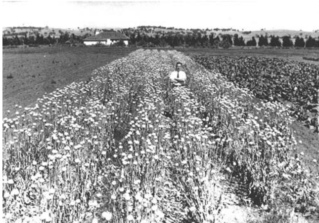
Poppy trial on Experiment Station c.1940s. O'Connor Ridge and Foreman's Cottage in the background.