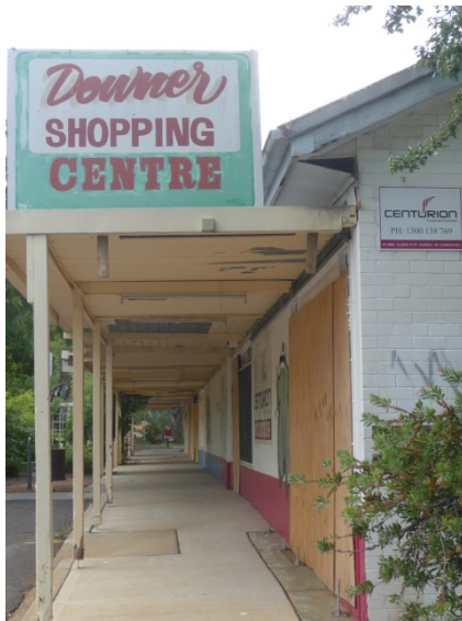
Former Machine Shed, January 2011