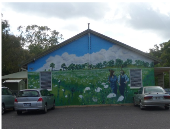
Former Workshop and Store, January 2011