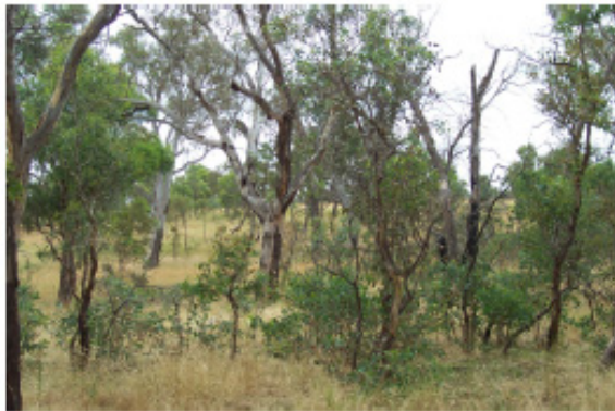
Yellow Box-Red Gum Woodland endangered ecological community at Kama, with strong eucalypt regeneration.