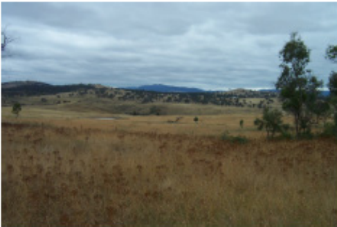
Natural Temperate Grassland endangered ecological community at Kama – extending down to the Molonglo River.