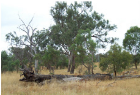
Yellow Box-Red Gum Woodland endangered ecological community at Kama, with standing fallen timber providing fauna habitat.