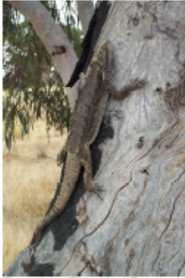
Common Bearded Dragon that was observed basking on a standing dead tree during 'Kama' site assessment visit (Jan 2006).