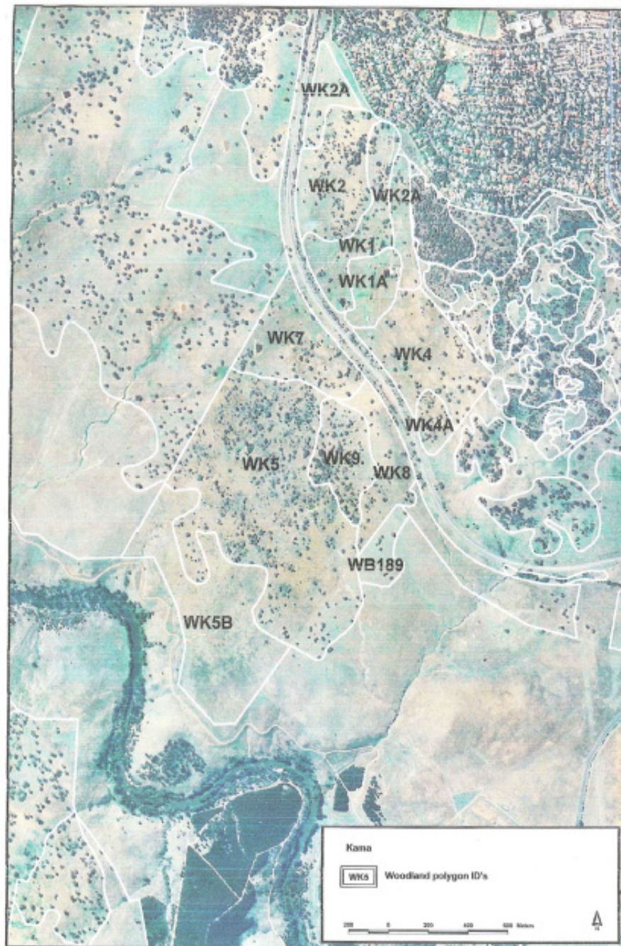
Map 2. Vegetation Polygons