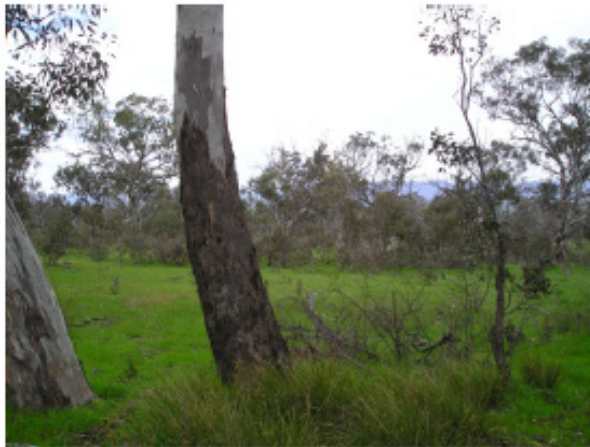
Yellow Box-Red Gum Woodland endangered ecological community at Kama in Spring.