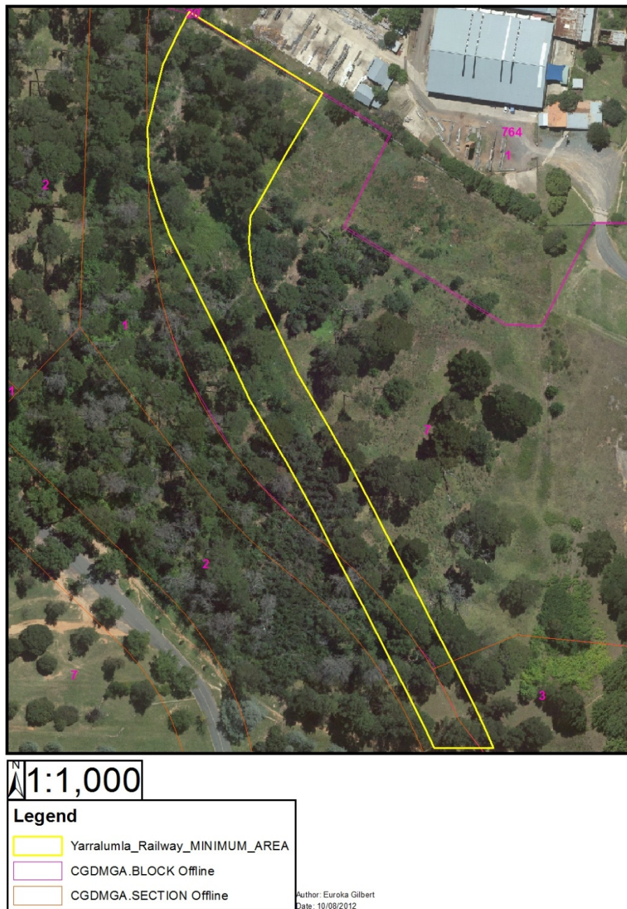
Figure 1. Yarralumla Brickworks Railway Remnants.