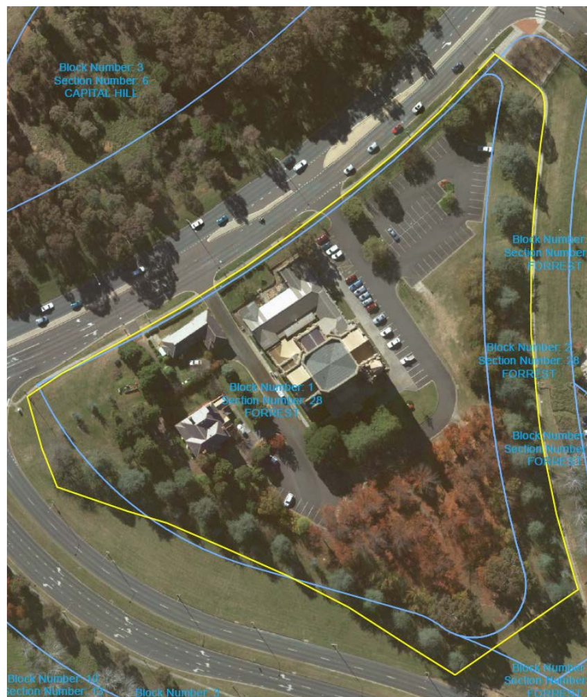
Image 1: St Andrew's Church Precinct boundary.