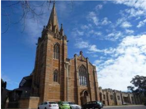
Image 2. Northeast facade with the nave on the left, spire, Warriors' Chapel and outdoor pulpit in the centre and the Hall on the right.