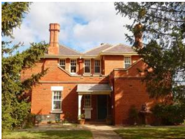
Image 6. Manse northeast facade with modern entrance (formerly side/maid's entrance).