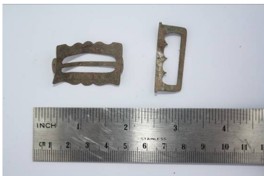
Fig. 8. Pieces of a hair clip (ACT Heritage Unit, 2013)