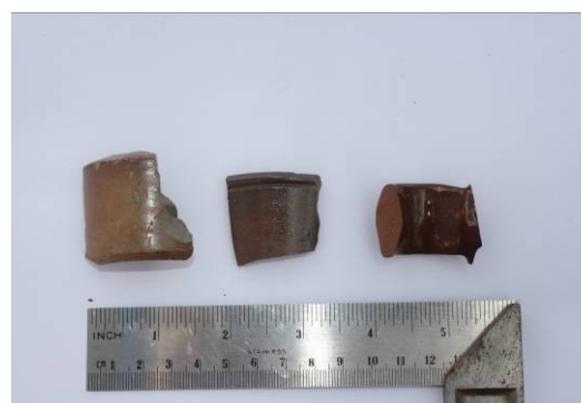
Figure 13. Ceramic fragments, including parts of ink bottles (ACT Heritage Unit, 2013)