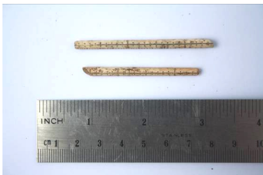
Fig. 10. Pieces of a Chinese apothecary gold scale