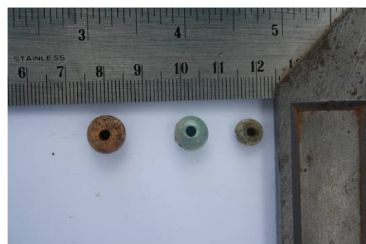
Fig. 6. A selection of beads (ACT Heritage Unit, 2013)