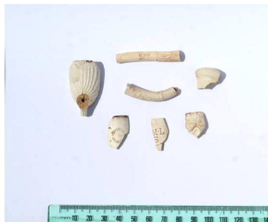
Fig.11. Bowl and stem fragments of clay pipes (ACT Heritage Unit, 2013)