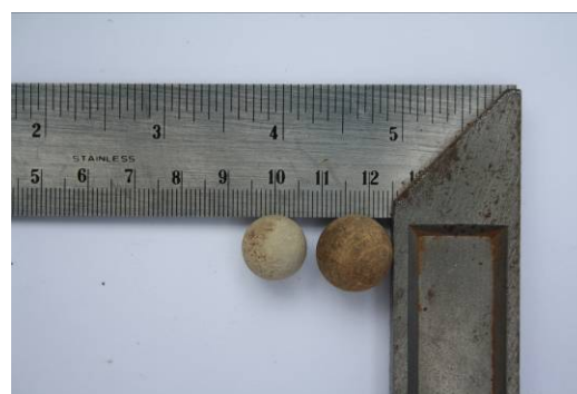
Fig, 12. Marbles (ACT Heritage Unit, 2013)