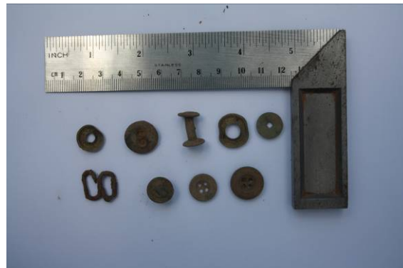
Fig. 4. A selection of clothing fasteners (ACT Heritage Unit, 2013)