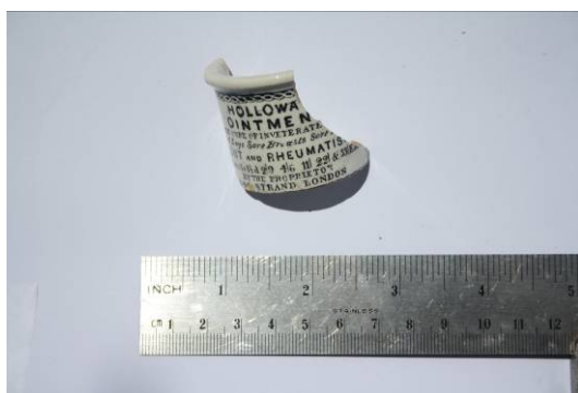
Fig. 9. Fragment of a Holloway Ointment Jar (ACT Heritage Unit, 2013)