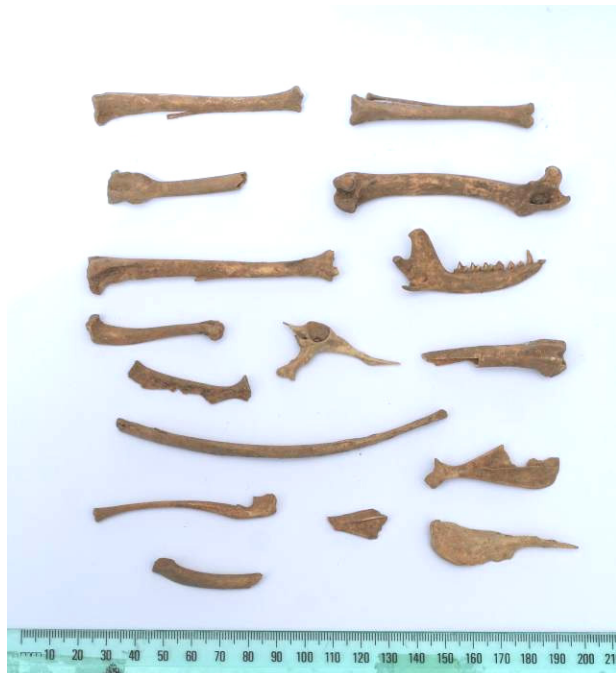
Fig. 1. Faunal Remains (ACT Heritage Unit, 2013)