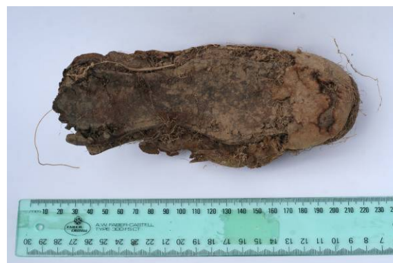
Fig. 5. Remains of an Adult leather shoe (ACT Heritage Unit, 2013)