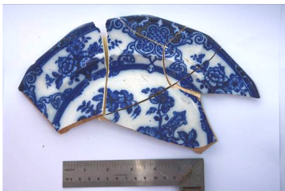
Fig. 3. Fragments of a plate (ACT Heritage Unit, 2013)