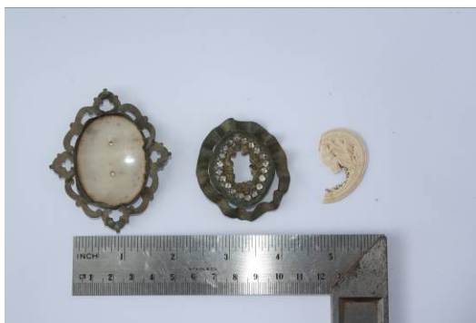
Fig. 7. A selection of brooches (ACT Heritage Unit, 2013)