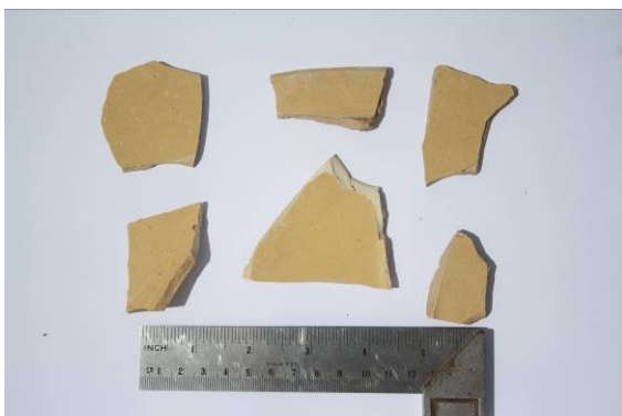
Fig 2. Ceramic fragments (ACT Heritage Unit, 2013)