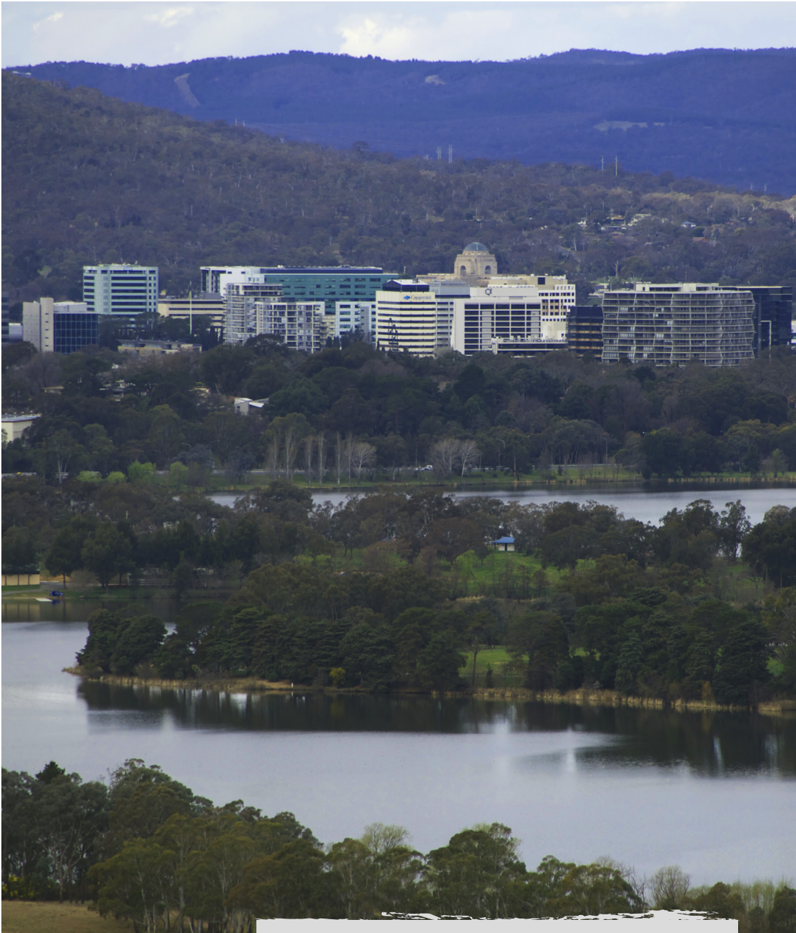
View to Canberra CBD from National Arboretum.