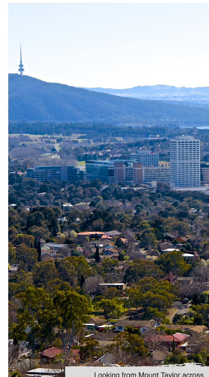
Looking from Mount Taylor across Woden Town Centre to Black Tower Mountain, ACT.