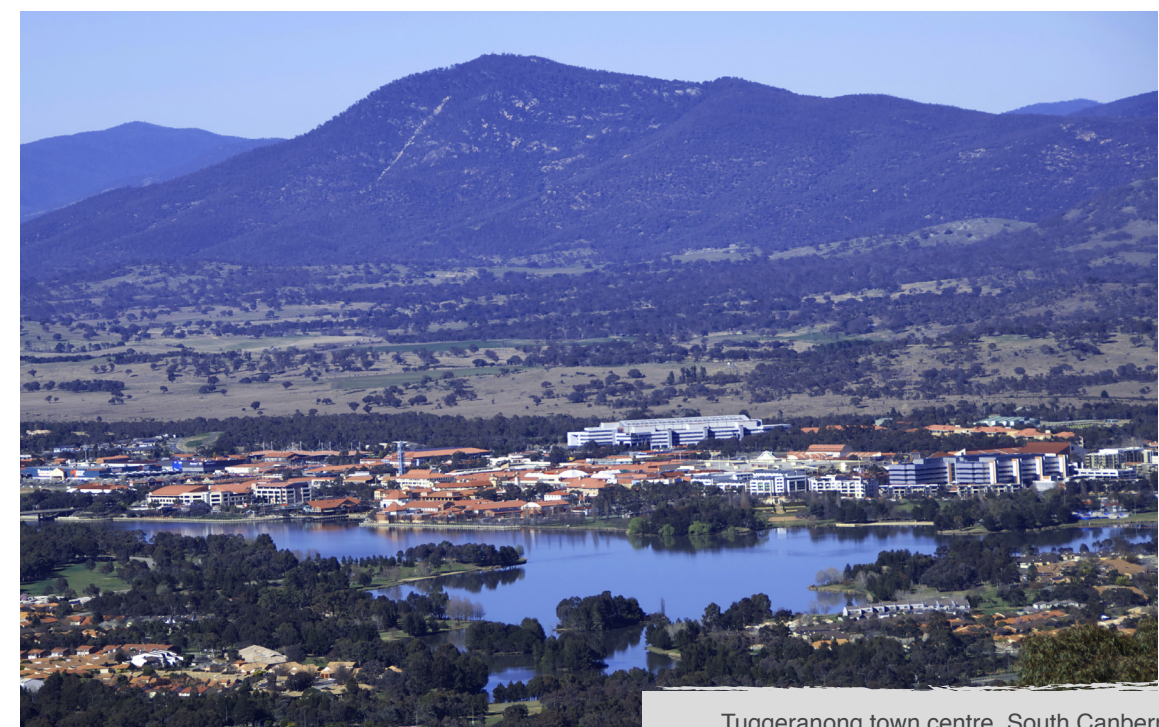
Tuggeranong town centre, South Canberra, ACT.