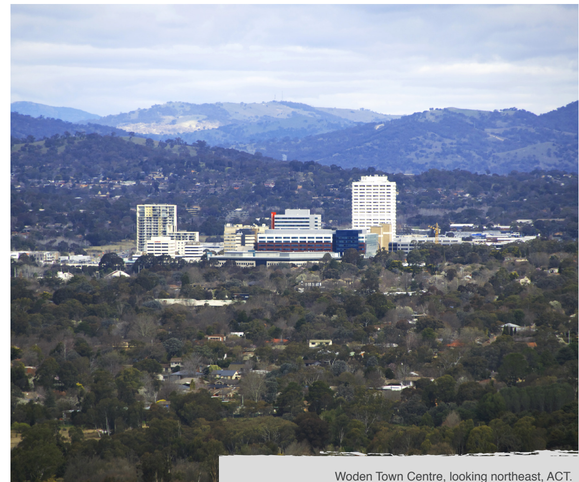
Woden Town Centre, looking northeast, ACT.

Further information regarding the special funding programs is outlined in this 2015 Training Plan, or alternatively you may contact the ACT Building and Construction Industry Training Fund Authority or visit www.trainingfund.com.au