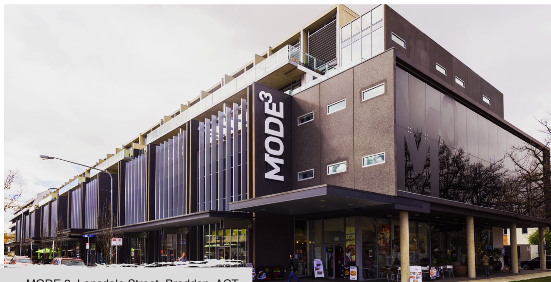
MODE 3, Lonsdale Street, Braddon, ACT.