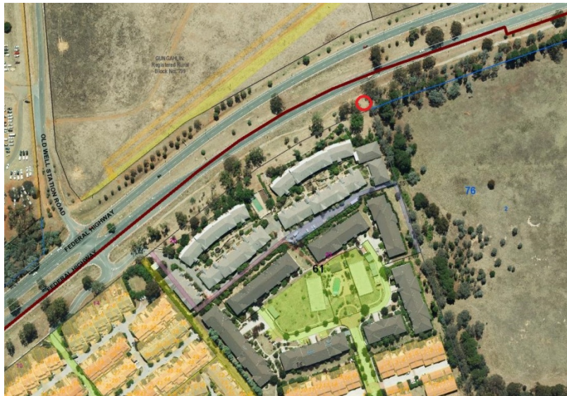
Sign location indicated by red circle.

The Starlight Drive-in Theatre Sign is located adjacent to the Federal highway, on road reserve. It is situated within 50 metres of its original location which marked the entrance to the Drive-in.