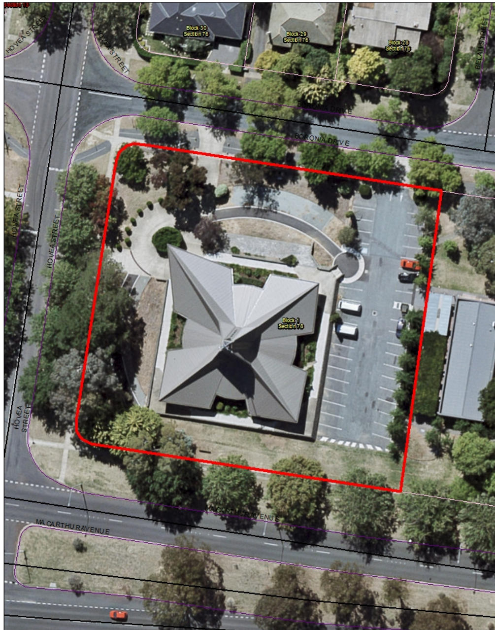
St Joseph's Catholic Church (part Block 1 Section 78 O'Connor)