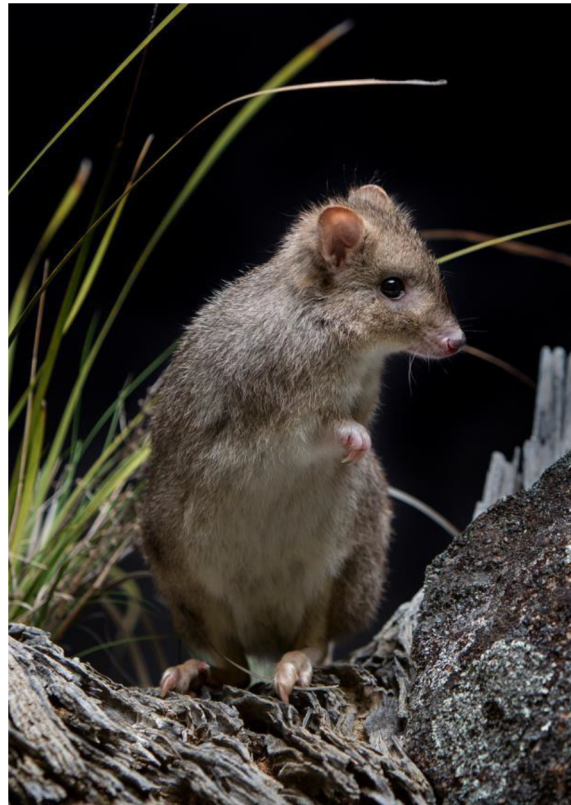
Eastern Bettong (Woodlands and Wetlands Trust)

The Eastern Bettong's prehensile tail is roughly the length of its body and often has a white tip. The tail is noticeably fleshy and an important storage organ for reserves, especially fat. Like most members of the family Potoroidae , little distinguishes male and female individuals although males may be slightly longer and slimmer. Eastern Bettongs may live for 3-6 years in the wild (Rose 1986).