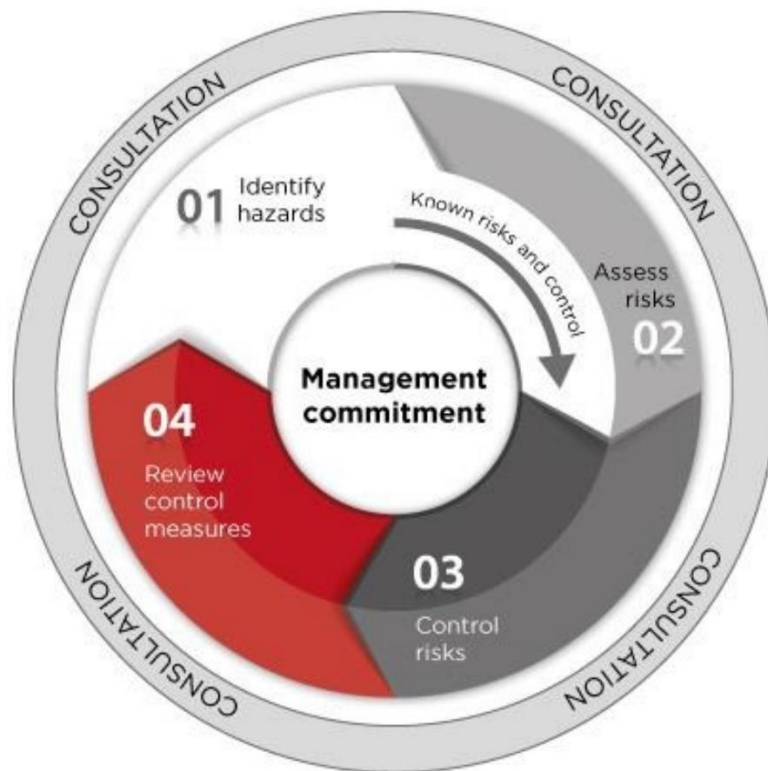
Figure 1 The risk management process

Further information is available in the Interpretive Guideline: The meaning of 'reasonably practicable' . The process of managing risk described in this Code will help you decide what is reasonably practicable in particular situations so that you can meet your duty of care under the WHS laws.