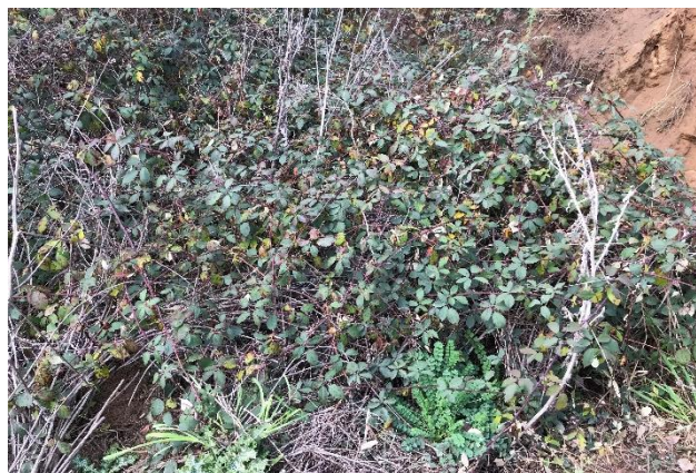
Blackberry ( Rubus fruticosus species aggregate)

Removal of pine wildings ( Pinus radiata ) is continuing in Gigerline, Bullen Range and Stoney Creek nature reserves and Pine Island, Kambah Pool and Uriarra recreation areas. Liaison is ongoing with PCS Fire, Forests and Roads on removal of wildings in adjoining areas.