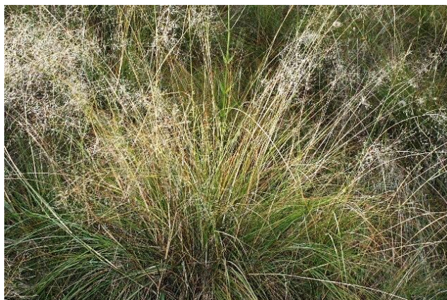
African Lovegrass ( Eragrostis curvula ) (Lois Padgham)

In accordance with the Nature Conservation Strategy, pest plant management plans have been developed for critical weed species. An Invasive Weeds Operations Plan is prepared each year to set out priority species and areas. Major weeds targeted for control in the MRC are Blackberry ( Rubus fruticosus species aggregate), Willow ( Salix spp.), Serrated Tussock ( Nassella trichotoma ), African Lovegrass ( Eragrostis curvula ) and Box Elder ( Acer negundo ).