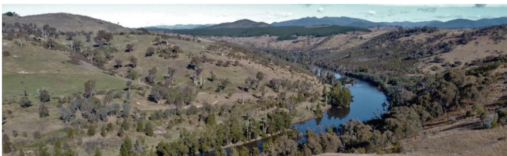
Murrumbidgee River upstream of Uriarra Crossing