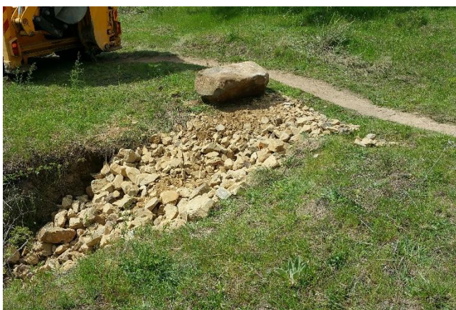
Stabilising a gully in Bullen Range Nature Reserve (PCS)

Control of rabbits has been important in reducing erosion in the MRC. Rabbit haemorrhagic disease virus (Calicivirus) has been effective in reducing rabbit numbers. As noted in Objective 1, PCS advises that rabbit densities have been reduced from up to 200/km 2 to <5/km 2 in all areas. (D Roso, pers. comm. 2021)