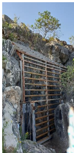
Bat friendly barrier, Cotter Caves (PCS)