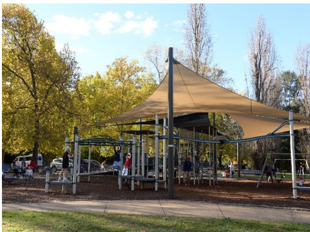
Playground at Cotter Avenue

In 2016, a policy was introduced to restrict camping at the Cotter Campground to a maximum of 14 consecutive nights, and a minimum of 28 nights between occupancies, to prevent the campground being used for temporary residence.