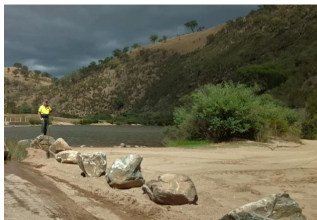
Installation of boulders to prevent vehicular access to the river at Angle Crossing (PCS)

Upper Murrumbidgee Waterwatch engages community volunteers in monitoring the condition of the upper Murrumbidgee catchment and produces an annual Catchment Health Indicator Program (CHIP) Report, which informs policy, on ground catchment management and State of the Environment reporting by the Commissioner for Sustainability and the Environment. The 2020 CHIP Report for the Murrumbidgee River (O'Reilly et al. 2021) showed the following results for water quality, water bug diversity and abundance, and riparian condition for reaches of the river between Michelago Creek and Ginninderra Creek (Table 1).