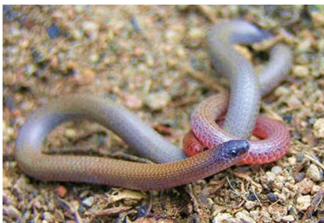
Pink-tailed Worm-lizard ( Aprasia parapulchella ) (EPSDD)