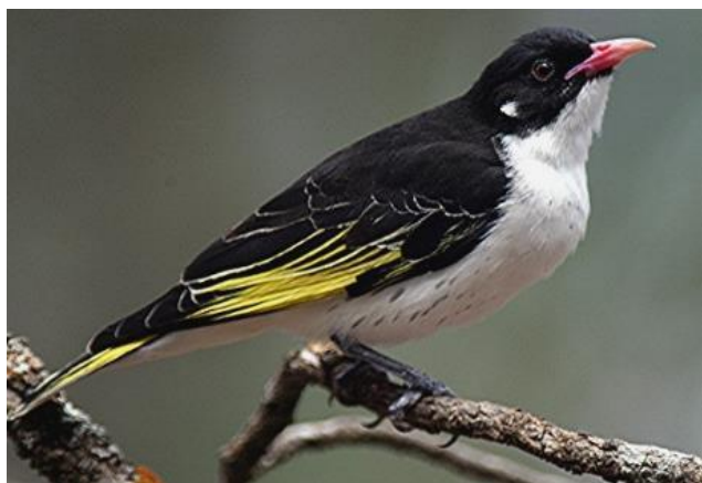
Painted Honeyeater ( Grantiella picta ) (Geoffrey Dabb)

The MRC provides important habitat for the vulnerable Pink-tailed Worm-lizard ( Aprasia parapulchella ). Management is guided by the recovery plan for the species (Osborne and Jones 1995) and habitat requirements are taken in consideration in implementing management actions, for example in revegetation programs no planting is undertaken on north-west facing rocky areas, particularly if Corkscrew Grass ( Austrostipa scabra ) or Kangaroo Grass ( Themeda triandra ) is present. African Lovegrass infestations in high-quality habitat areas are controlled by spraying.