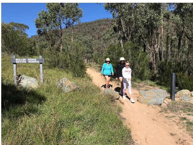
Walking on the Murrumbidgee Discovery Track in Bullen Range Nature Reserve

The ACT Parks and Conservation Service provides for appropriate recreational activities in multiple locations along the MRC, which is one of Canberra's most popular places for nature-based recreation. Activities include bushwalking, camping, picnicking, wildlife observation and birdwatching, as well as water-based pursuits such as swimming, fishing and canoeing. The area includes five nature reserves and eight special purpose reserves, with seven recreation areas. Most of the MRC recreation areas are open 24 hours a day, 365 days a year, although Pine Island and Kambah Pool are closed to vehicles at night.