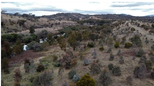
Trees planted under the One Million Trees program at the Gudgenby River confluence in Gigerline Nature Reserve

In the decade to 2018, 300,000 native trees were planted in the Corridor, including 30,000 in Gigerline Nature Reserve, as part of planting one million trees across the Territory to help rebuild a resilient ecosystem and assist the ACT in tackling the challenge of climate change under the ACT’s 2007 climate change strategy Weathering the Change (ACT Government 2007).