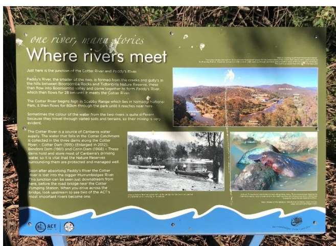
Information sign at Cotter Bend