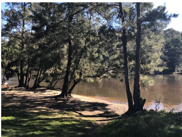
River She-oak ( Casuarina cunninghamiana ) at Uriarra East

Riparian vegetation plays a vital role in maintaining aquatic habitats through protecting the stream from surrounding land uses, preventing erosion and sedimentation, providing nutrients and habitat components from fallen logs and other debris, and shading water and reducing temperatures (ACT Government 2018a).