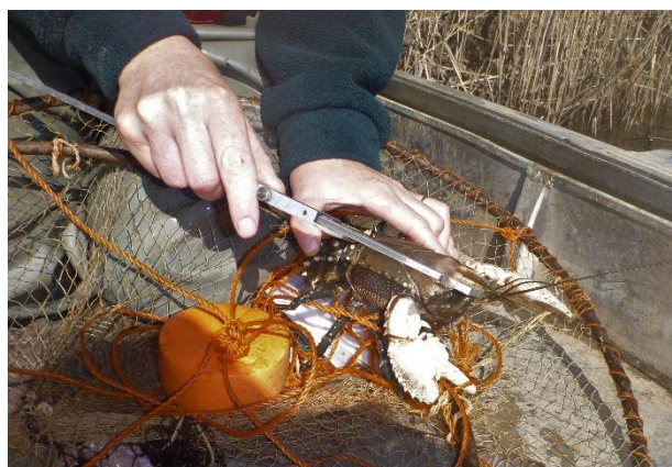
Measuring Murray River Crayfish ( Euastacus armatus ) (Mark Jekabsons)

A Condition Assessment & Monitoring Plan recently developed under the CEMP by Malam et al. (in preparation) for aquatic and riparian ecosystems will assess their condition using monitoring data aligned with indicators and corresponding metrics. Ecological indicators include water flow and quality, stream channel geomorphology, native flora and fauna, riparian vegetation and riparian zone connectivity. Ecosystem threat indicators include inappropriate flow and fire regimes, invasive plants, introduced fish and terrestrial species, and erosion and sedimentation.