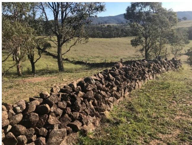
Tuggeranong Boundary Marker

Conservation work at Cotter Caves has included removal of graffiti and the installation of secure, bat-friendly barriers to exclude unauthorised access.