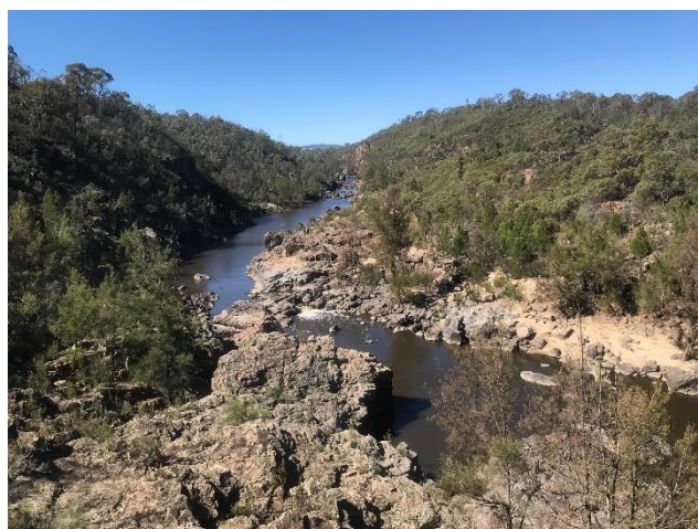
Red Rocks Gorge from the Murrumbidgee Discovery Track, between Kambah Pool and Pine Island

The 27-kilometre Murrumbidgee Discovery Track extends along the riverside from Point Hut Crossing in the south through to Pine Island, Kambah Pool and Casuarina Sands to the north. Mountain biking is generally not permitted on walking trails but is allowed on sections of the riverside trail from Kambah Pool to Point Hut Crossing. There has been significant investment in maintaining and enhancing this trail, particularly following the impacts of the 2003 fires on infrastructure in the Corridor.