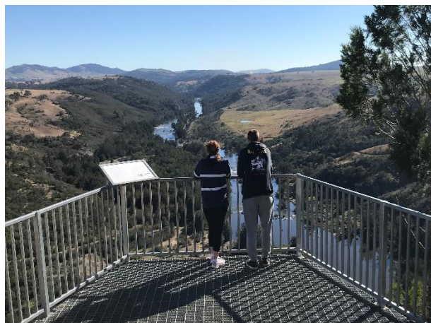
Enjoying the view at Shepherds Lookout

Recreation areas are well serviced with mown areas, playgrounds, picnic tables, and free electric or wood-fired barbecues. PCS staff maintain these areas to a high standard and significant improvements have been made over the life of the current plan, including upgrades to walking tracks and trails, upgrade of recreational facilities at Casuarina Sands and Casuarina Sands North, and upgrade of Cotter Campground. Shade sails were installed over the Pine Island and Cotter Avenue playgrounds in 2020. Regular inspection of playground equipment is carried out by PCS staff and/or City Services and maintenance is conducted as required.