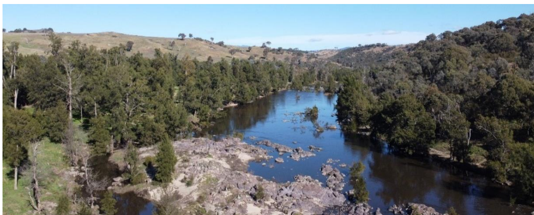
Murrumbidgee River at Uriarra Crossing

It will be critical for any new plan for the MRC to incorporate directions and actions from these strategies and for appropriate mechanisms to be established for evaluating management effectiveness in achieving desired outcomes for relevant ecosystems and other values within the Corridor.