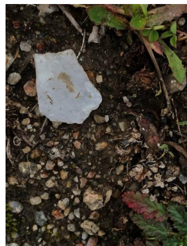
Quartz flake, Gudgenby River confluence

In 2018, the ACT Heritage Council considered a nomination of the MRC to the ACT Heritage Register. The Council decided not to provisionally register the MRC on the grounds that the place only has natural heritage significance of a kind that is protected under the Nature Conservation Act 2014 , any cultural heritage significance was already captured by existing registrations or nominations, and the nomination under assessment did not include any other cultural heritage significance.