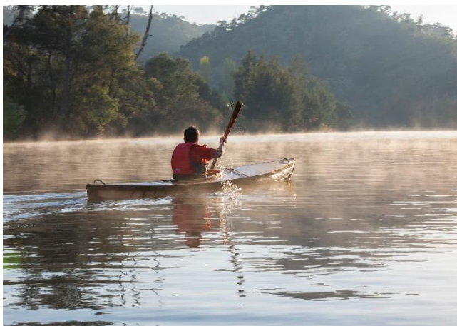
Kayaking at Casuarina Sands

Horse riding is permitted on the Bicentennial National Trail. Dogs are generally excluded from the MRC and are permitted only at Uriarra picnic areas, Shepherds Lookout and the Dog Exercise Area at Point Hut. Monitoring of dog access to recreation areas is ongoing, and fines may be issued for non-compliance.