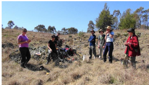
Parkcarers of Southern Murrumbidgee volunteers take a break from planting trees in the Corridor

Under the ACT Woodlands Restoration Program (2011–2018) 60,000 hectares of the largest remaining box–gum grassy woodland landscape in Australia have been restored and connected in areas including the MRC and linkages between Kama Nature Reserve and the Stony Creek tributary.