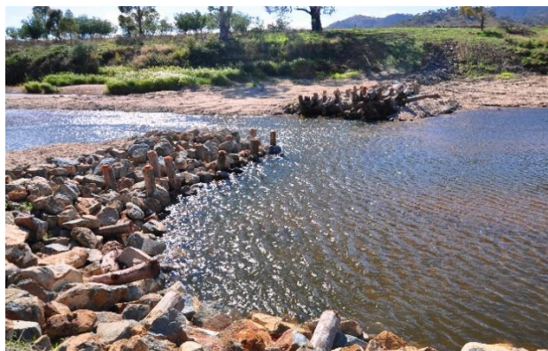
Engineered Log Jam downstream of Tharwa