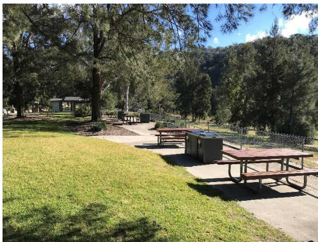
Electric BBQs and picnic tables at Casuarina Sands

Over the life of the current plan, management access has been rationalised and eroding tracks closed and rehabilitated. A management trail has been constructed from Point Hut to Bullen Range Nature Reserve. There have been upgrades to walking tracks and ongoing maintenance of roads, walking tracks and interpretive signs. Several initiatives are underway to set the strategic direction for nature-based tourism in the ACT, including development of a Nature-based Tourism Strategy for the Territory and a Landscape Classification System (LCS) for PCS-managed reserves. The LCS clarifies sites, areas or linear features according to scores against physical, social and management criteria. Zones within the PCS estate will be consistently categorised using the LCS and relevant urban and rural zoning, providing a framework to