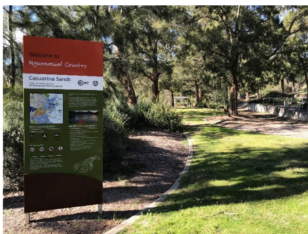
Welcome sign at Casuarina Sands

Information on recreational fishing in the ACT has been provided in various documents following the introduction of the Fisheries Act 2000 . The current ACT Government brochure Recreational Fishing in the ACT (ACT Government 2020) is regularly reviewed against community and legislative needs and is translated into several languages other than English. This information is helping to increase community awareness of sustainable fishing practices. The brochure is available at some fishing stores, from PCS rangers and online.