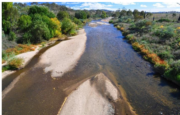
Sedimentation downstream of Tharwa Bridge (Mark Jekabsons)

Initiatives to enhance habitat for Murray Cod and other native fish species have included research to identify barriers to fish passage (Lucas et al. 2019), the installation of fishways at Casuarina Sands and Cotter River weir, and construction of instream rock deflectors and engineered log jams at several locations near Tharwa. Monitoring results show increased river channel depth past the instream structures and improved habitat in the area. Trout Cod breeding has been detected and the numbers of Murray Cod have significantly increased (Upper Murrumbidgee Demonstration Reach n.d.).