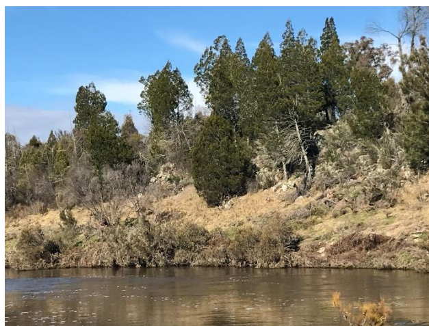
Black Cypress Pine ( Callitris endlicheri ) at Pine Island

A 2009 survey of vegetation and habitat in key riparian zones of the MRC (Johnston et al. 2009) found that riparian and valley slope vegetation communities in the Corridor were in moderate to low condition, having been significantly impacted by land management practices and the 2003 bushfires. The riparian zone was found to have a very high cover and abundance of weed species and to be a major conduit for the