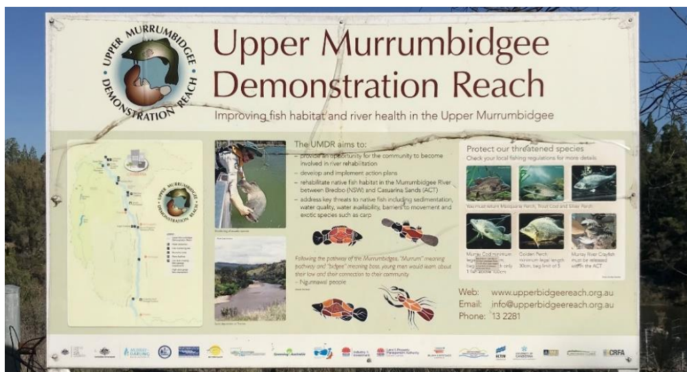
Upper Murrumbidgee Demonstration Reach sign at Pine Island Recreation Area

The UMDR program demonstrates techniques that landholders and community groups can use to rehabilitate and protect aquatic and riparian habitat. In addition to engineered log jams, work has included 56,800 native plants planted, 85 km of willows controlled, 89 km of river fenced to exclude stock, fish passage through Casuarina Sands, two carp trapping trials, two gross sediment studies to guide sand slug rehabilitation works, field days and community events (Upper Murrumbidgee Demonstration Reach n.d.).