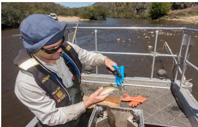
Genetic sampling of Murray Cod ( Maccullochella peelii ) to assess populations (Mark Jekabsons)

Adaptive management for conservation of ecosystems requires research and monitoring to be integrated with on-ground action. A Conservation Effectiveness Management Program (CEMP) is being established by EPSDD for lowland native grasslands, upland grasslands, lowland woodlands, upland woodlands, lowland forests, upland forests, bogs and fens and riparian/aquatic ecosystems. Its purpose is to create a coordinated, systematic and robust biodiversity monitoring program to detect changes in ecosystem condition within reserves, evaluate the effectiveness of management actions in achieving conservation outcomes, and provide evidence to support management decisions.