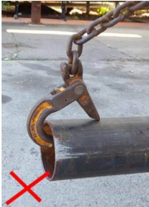
Figure 13: Sling hook inserted into pipe

All lifting gear, including slings, hooks and material boxes, should be periodically inspected for damage and wear by a competent person. The period between inspections will depend on the severity of use, but should not exceed 12 months. The inspection of synthetic slings should be carried out at three-monthly intervals (see AS 1353.2: Flat synthetic-webbing slings – Care and use and AS 4497.2: Round slings – Synthetic fibre – Care and use for further information). All lifting gear should be tagged to identify the date of the lifting gear's last inspection. Documented maintenance records for the lifting gear should be available on site.