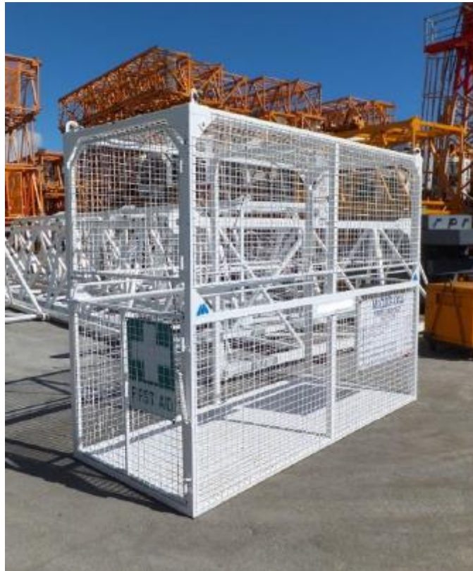
Figure 14- Compliant first aid box

Strong winds may affect the safe use of first aid boxes in emergency situations. It is recommended that first aid boxes not be used when wind speeds exceed 54km/hr or in adverse weather conditions such as electrical storms. The use of first aid boxes is more suitable in locations which are less susceptible to windy conditions, such as the side of a building structure which is not as exposed to high winds. First aid boxes should be lifted away from structures to avoid collision.