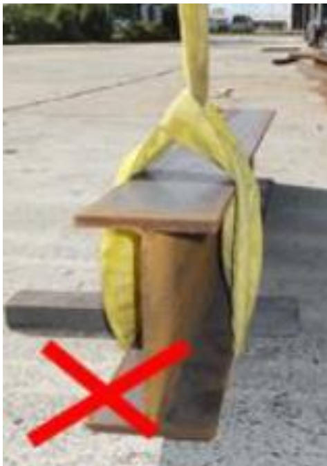
Figure 10: Unsafe use! Edges of I-Beam may cut sling