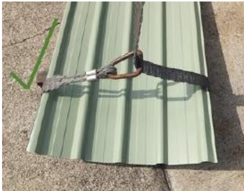
Figure 6: A steel webbing sling being used to lift roof sheeting – edges will not damage this type of sling

The following photographs provide examples of correct use of slinging techniques: