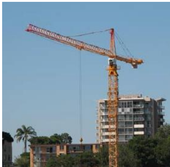
Figure 2: Hammerhead tower crane

Self-erecting tower cranes are discussed in more detail under Section 8 Additional requirements for self-erecting cranes .