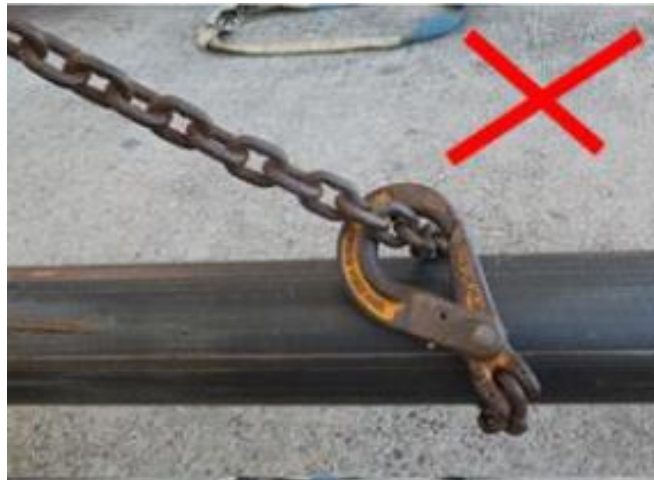
Figure 11: Chain sling with single wrap choke around steel pipe - does not prevent slippage