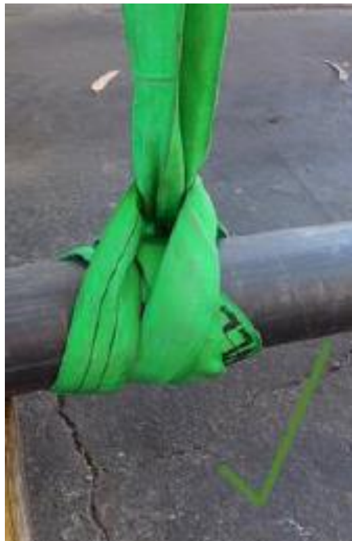
Figure 8: Round webbing sling with double wrap choke around steel pipe - large radius so sling protection not required