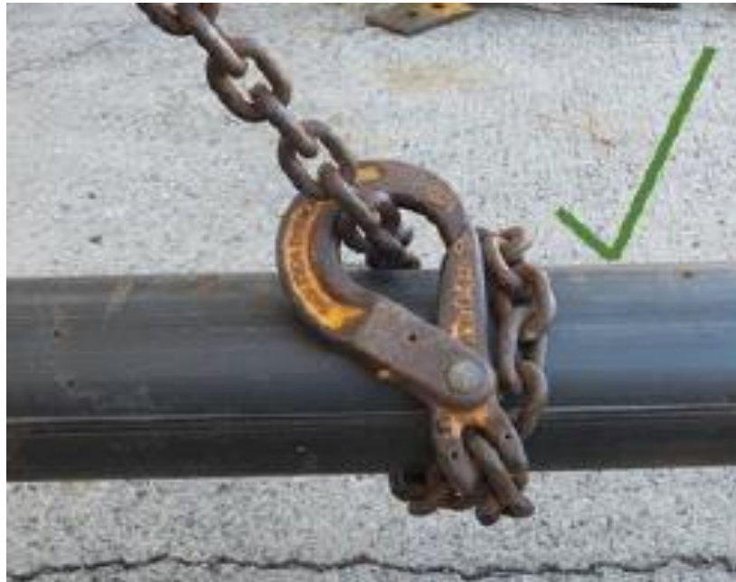
Figure 7: Chain sling with double wrap choke around steel pipe - helps to prevent any slippage