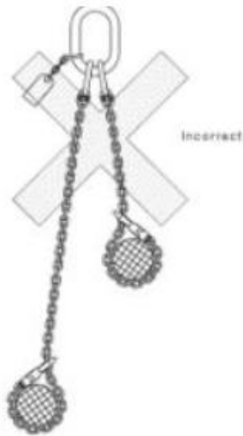
Figure 4: Unsafe hi-low lift