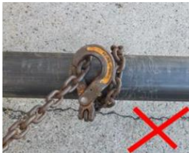
Figure 12: Chain sling with chain bearing against latch