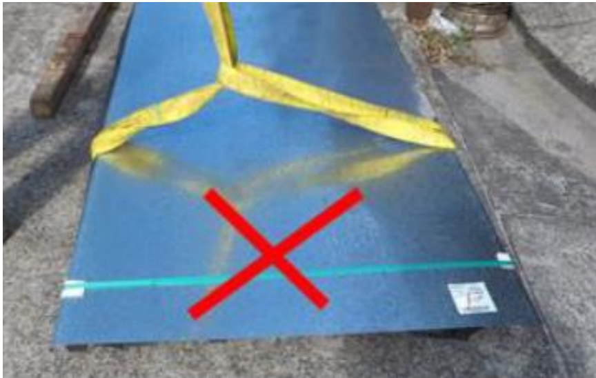
Figure 9: Unsafe use! Edges of metal sheet may cut sling

The following photographs provide examples of incorrect use of slinging techniques: