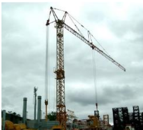
Figure 15- Self-erecting tower crane

The use of self-erecting tower cranes (see Figure 15 ) is increasing, particularly on small to mid-sized building sites. As the name suggests, self-erecting tower cranes can be erected on site without using a mobile crane. Self-erecting tower cranes are generally made up of a horizontal boom that folds out during erection, and can include a telescopic boom. The counterweight is provided at the base of the crane.