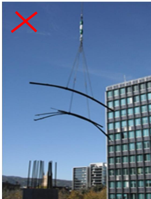
Figure 5: Unsafe multiple vertically loaded lifts (Christmas Tree Lift)