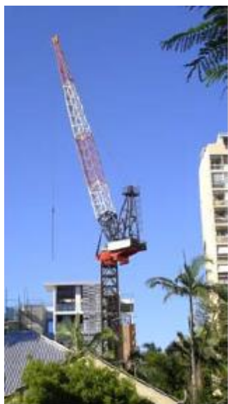
Figure 1: Luffing tower crane

There are basically three types of tower cranes operating in the Territory – luffing (see figure 1 below), hammerhead (see figure 2 below) and self-erecting tower cranes (see figure 13 on page 52 ). Each type of tower crane has advantages and disadvantages, and the best crane type should be selected for the job to be undertaken.