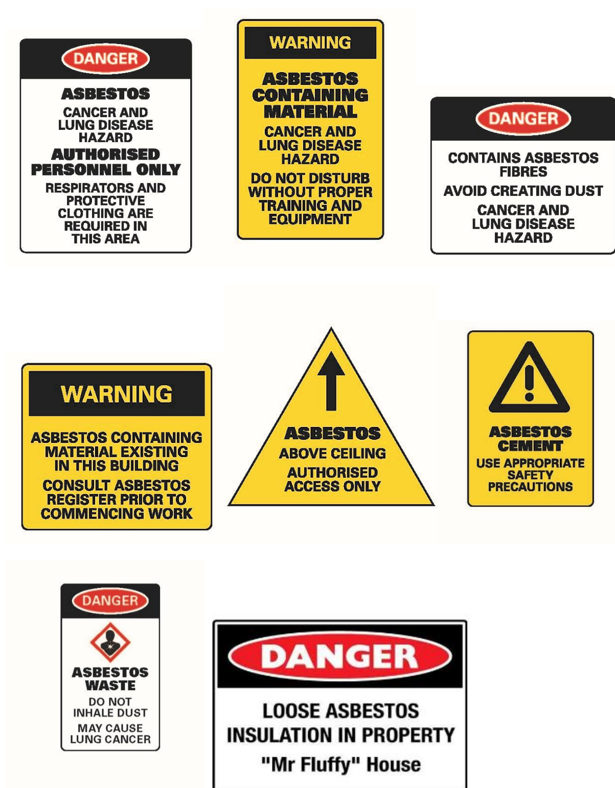
Figure 2 Examples of warning signs for asbestos