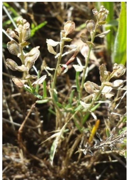
Ginninderra Peppercress (Greg Baines – Canberra Nature Map)

The species produce seeds in early summer with most seeds dispersed before August and the end of winter (Avis 2000). Germinability was tested on 4-year-old seeds stored under controlled conditions finding 100% viability and germination (Taylor et al. 2014).