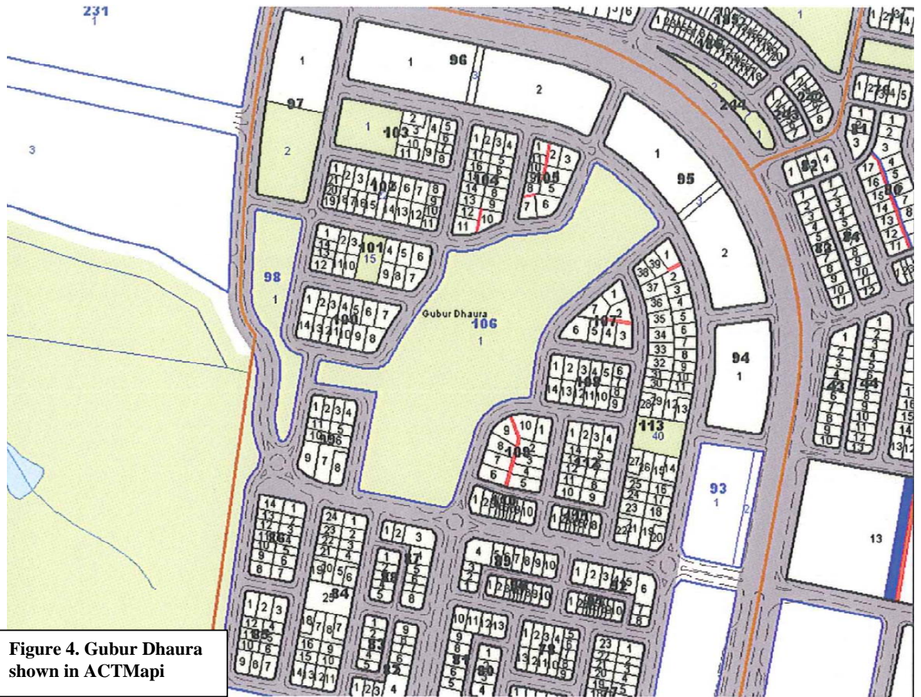
Figure 4. Gubur Dhaura shown in ACTMapi